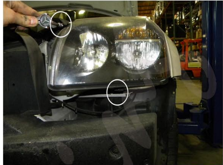
6. Remove two 8mm headlight bolts