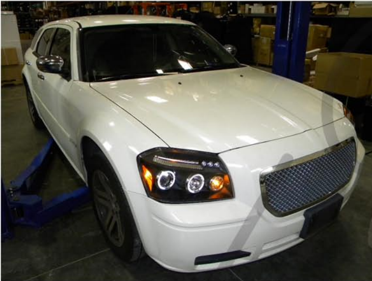
13. The installation is now complete