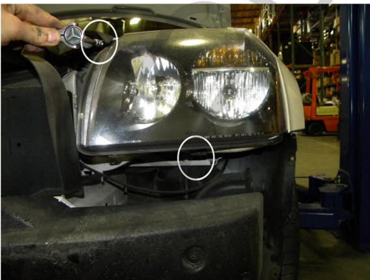
9. Install two 8mm headlight bolts