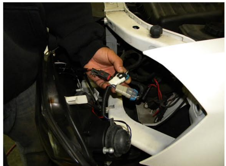
10. Connect all connectors from the headlight Please see the Halo and L.E.D installation instruction If your headlights don't have HALO or L.E.D. You can skip it