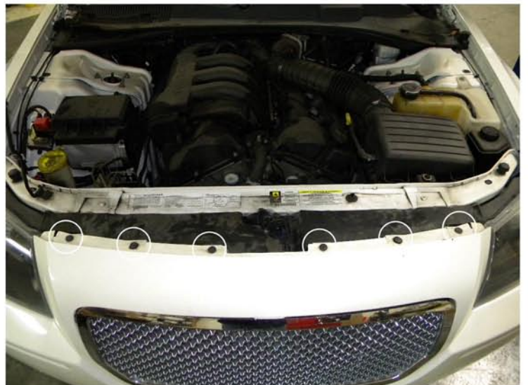
4. Remove six clips