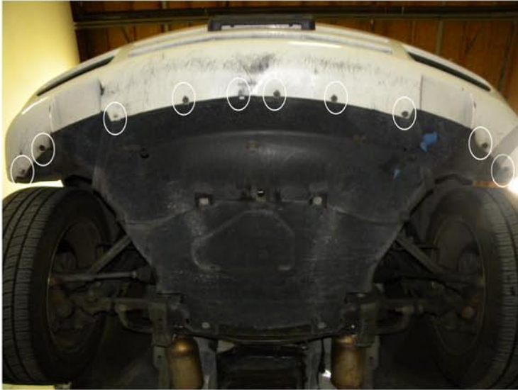
1. Remove ten 7mm bolts

If you experience any difficulties that the instruction did not cover, Please seek local auto shop for advise. Please wear protection before you work on your vehicle. An assistant is helpful when removing the front bumper. Please be careful while working with the bumper or body part to avoid scratching. Do not make direct contact with the halogen bulb or the wire assembly until the unit has cooled down after use.