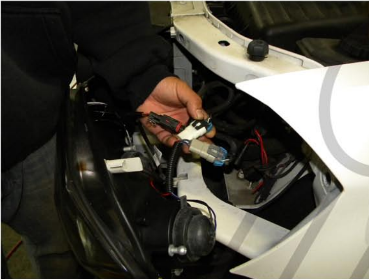
7. Disconnect all the connectors from the headlight