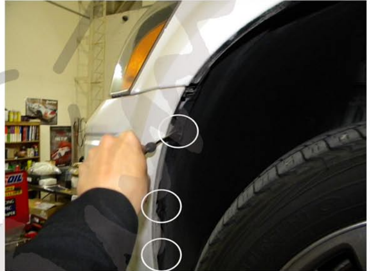
2. Remove three clips