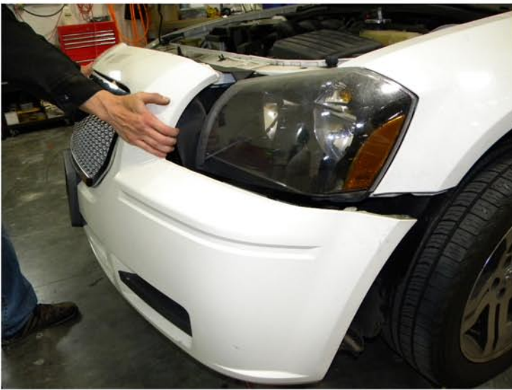
11. Install the front bumper