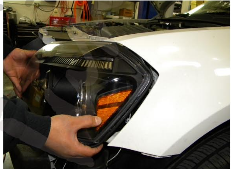
8. Install the new projector headlight