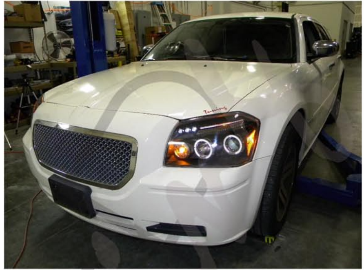
12. Please repeat the picture order from 1 to 11 for the opposite side