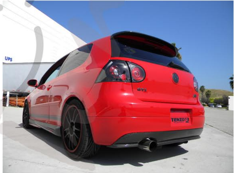
8. The installation is now complete