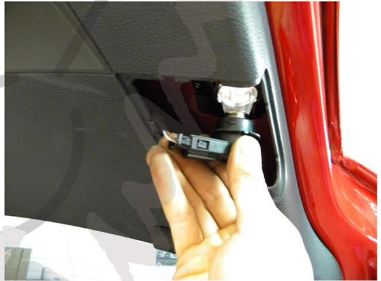
2. Remove back up light light bulb socket