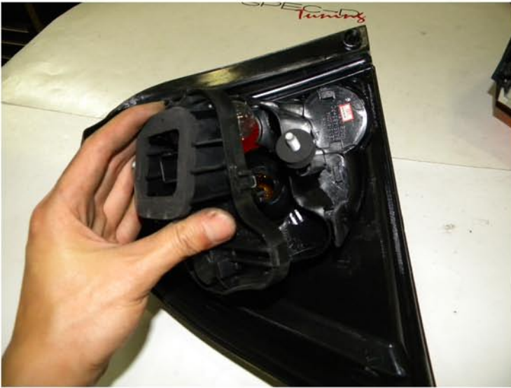
11. Install taillight socket to the new taillight