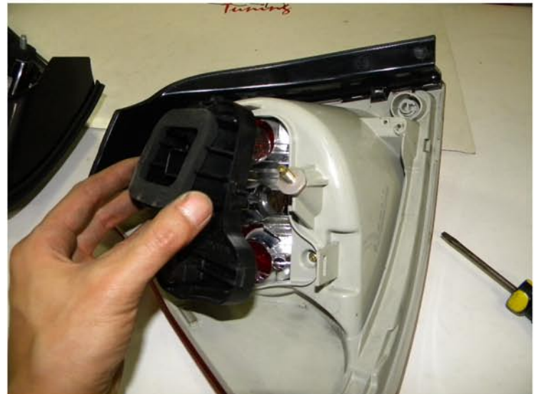
10. Remove the taillight socket from the OEM taillight