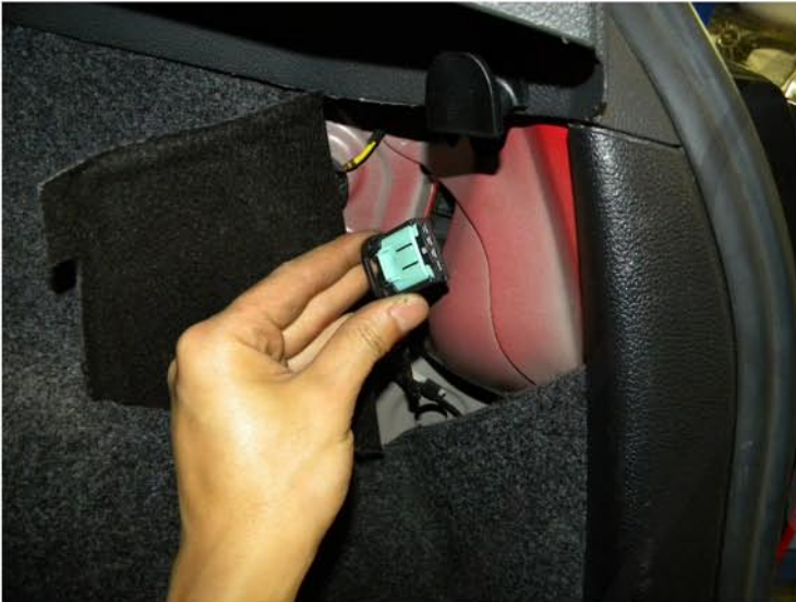
13. Connect the taillight harness please repeat the picture order from 1 to 13 for the opposite side