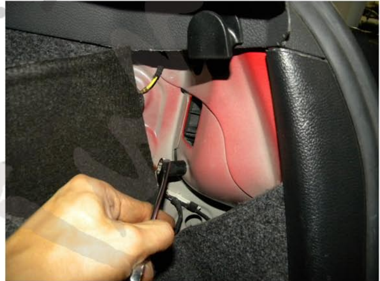
8. Remove two 13mm taillight bolts