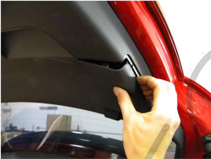
1. Remove the cover from inside of the trunk

If you experience any difficulties that the instruction did not cover, Please seek local auto shop for advise. Please wear protection before you work on your vehicle. An assistant is helpful when removing the front bumper. Please be careful while working with the bumper or body part to avoid scratching. Do not make direct contact with the halogen bulb or the wire assembly until the unit has cooled down after use.