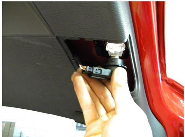
4. Install new trunk taillight two 10mm bolts and install back up light socket