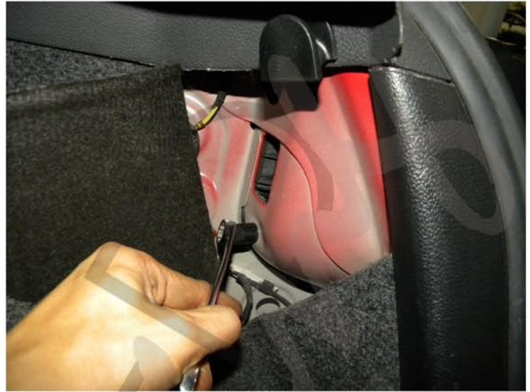
12. Install the new taillight and two 13mm taillight bolts