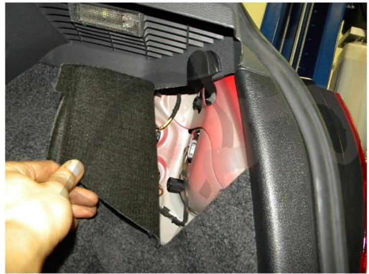
6. Remove the cover