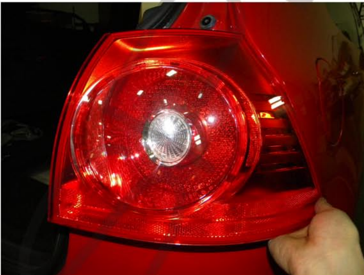
9. Remove the taillight