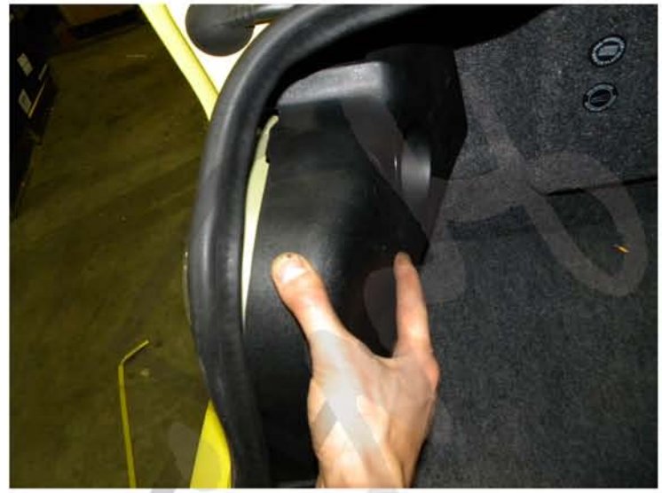
12. Replace the plastic cover

Please repeat the steps in order from 1 to 12 for the opposite side