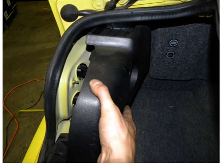
2. Remove the plastic cover