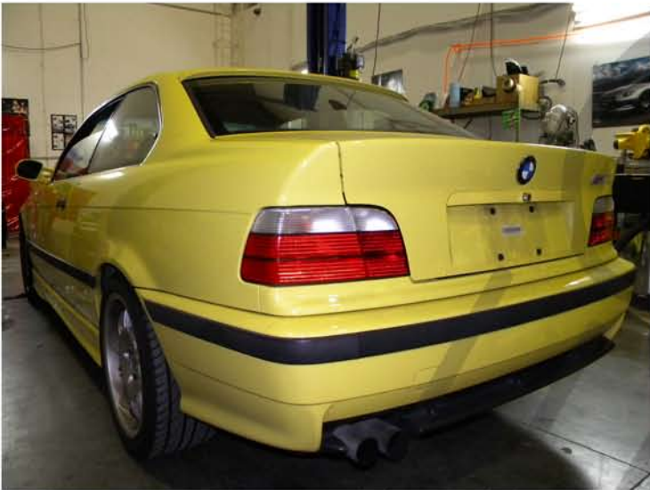
13. The installation is now complete

Please repeat the steps in order from 1 to 12 for the opposite side