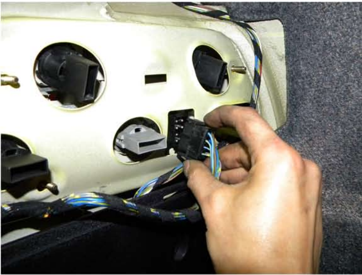
5. Disconnect the taillight harness