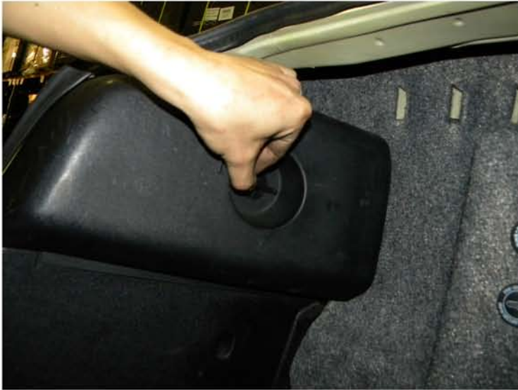
1. Turn the plastic knob

Do not make direct contact with the halogen bulbs or the wire assembly until the unit has cooled down after use.