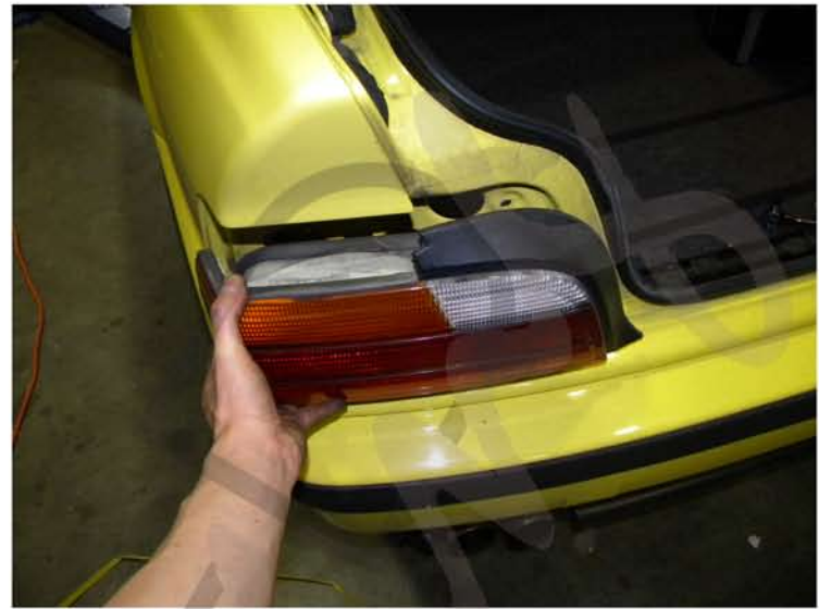
6. Remove the taillight