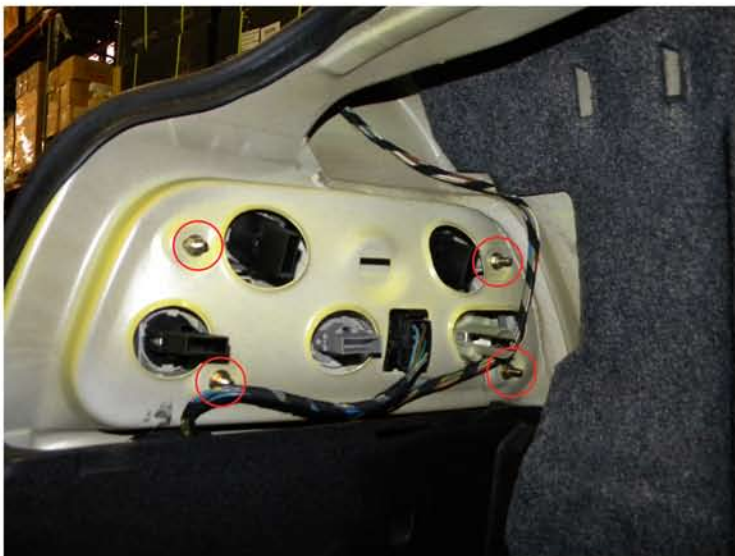
3. (4) 8mm nuts location