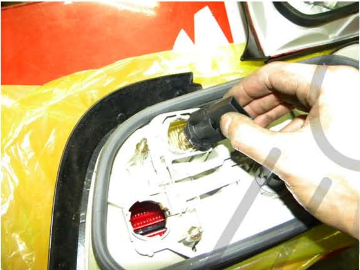
7. Remove the taillight sockets