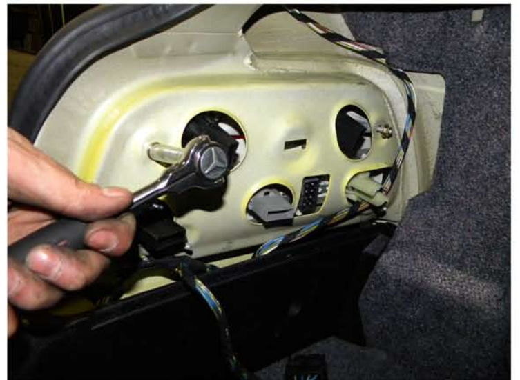
10. Tighten the (4) 8mm nuts