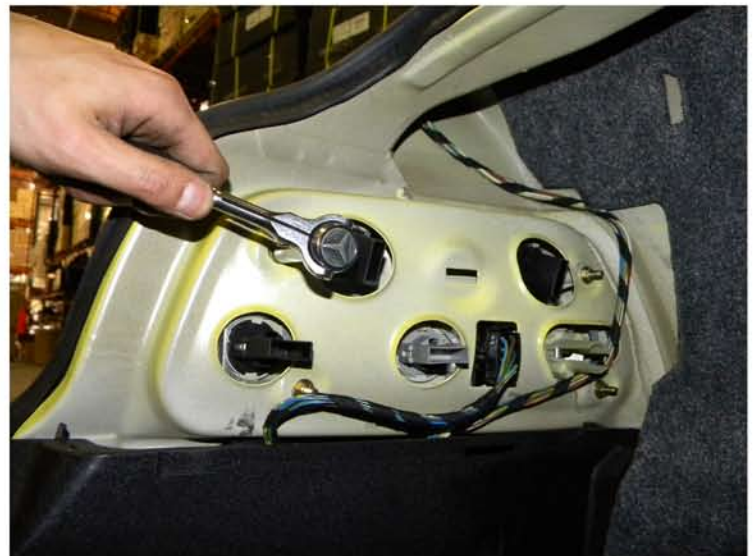
4. Remove the (4) 8mm nuts