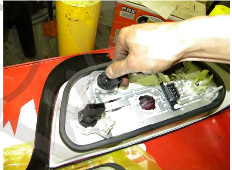
8. Place the taillight sockets in the new taillight