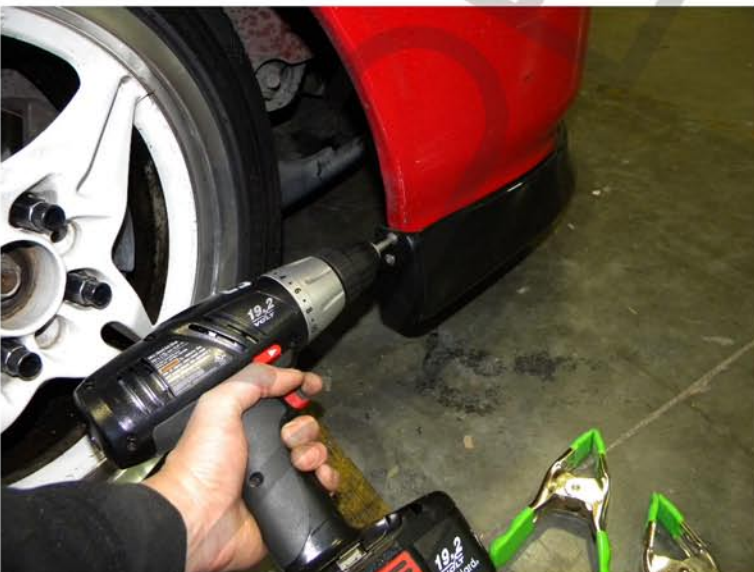
3. Fasten the chin spoiler with the (2) self tapping screws