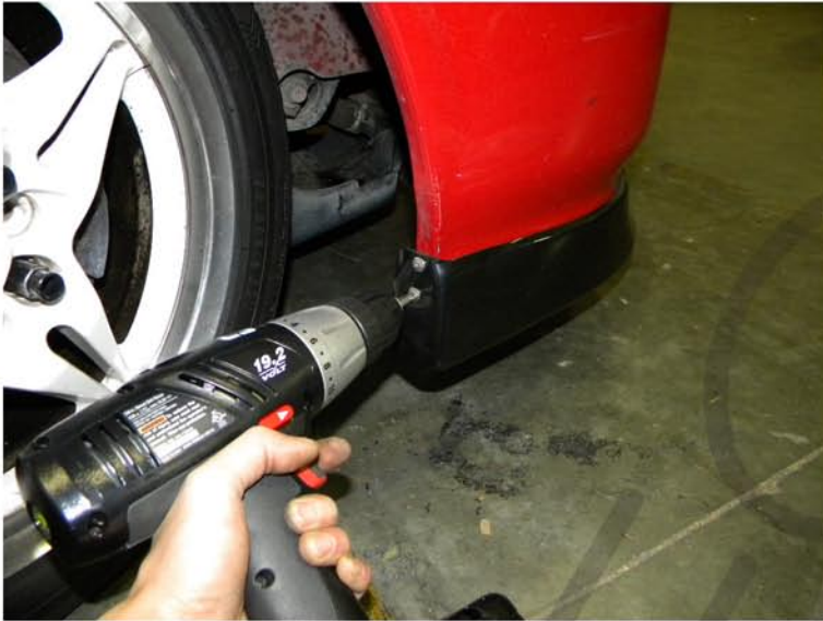
1. Fasten the chin spoiler to the front bumper with (2) self tapping screws

If you experience any difficulties that the instruction did not cover, Please seek local auto shop for advise. Please wear protection before you work on your vehicle. An assistant is helpful when removing the front bumper. Please be careful while working with the bumper or body part to avoid scratching. Do not make direct contact with the halogen bulb or the wire assembly until the unit has cooled down after use.