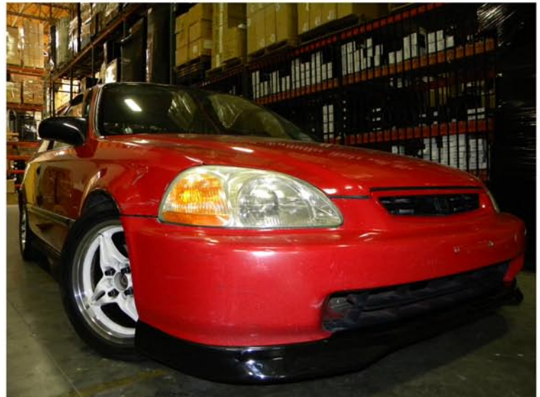
4. The installation is now complete