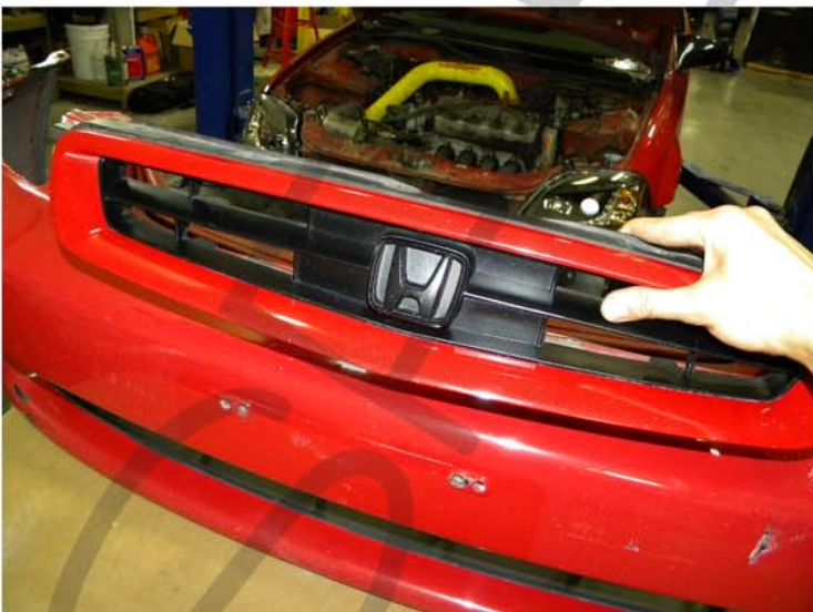
9. Remove the stock grille