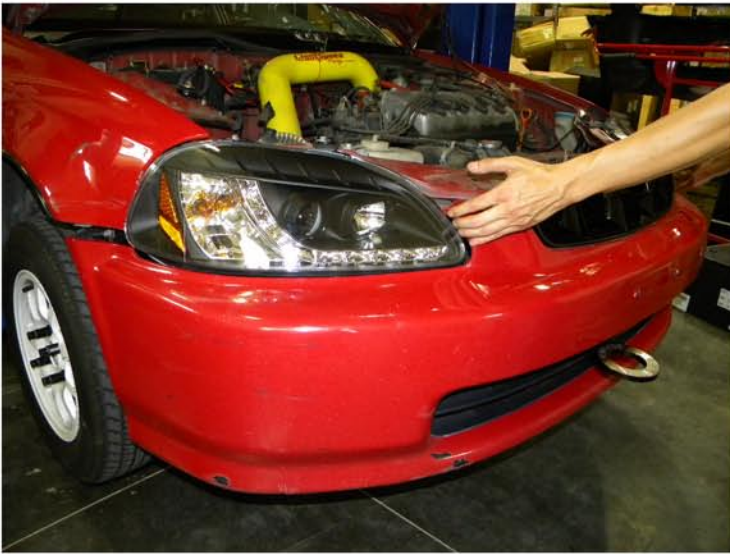
11. Put back the front bumper