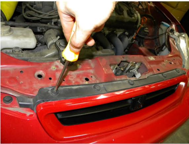
5. Remove the seven plastic clips