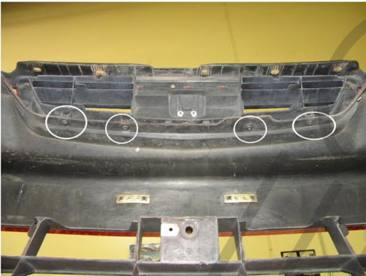
7. There are 4 grille screws