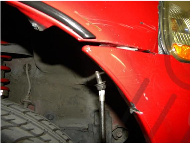
13. Reinstall the screw