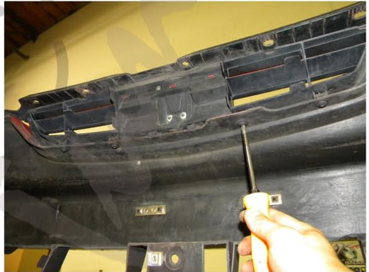
8. Remove the four screws