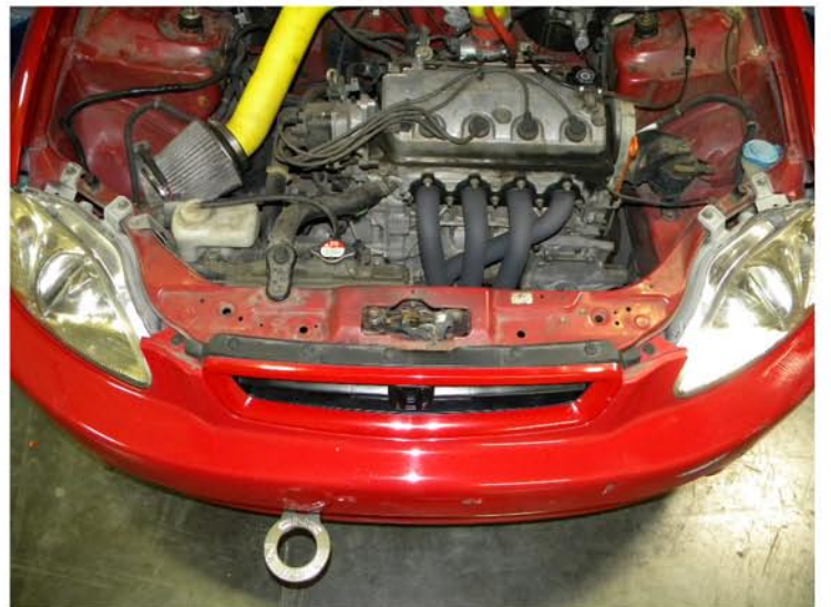
4. On the top of the front bumper. there are seven clips