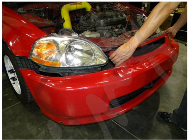
6. Remove the front bumper