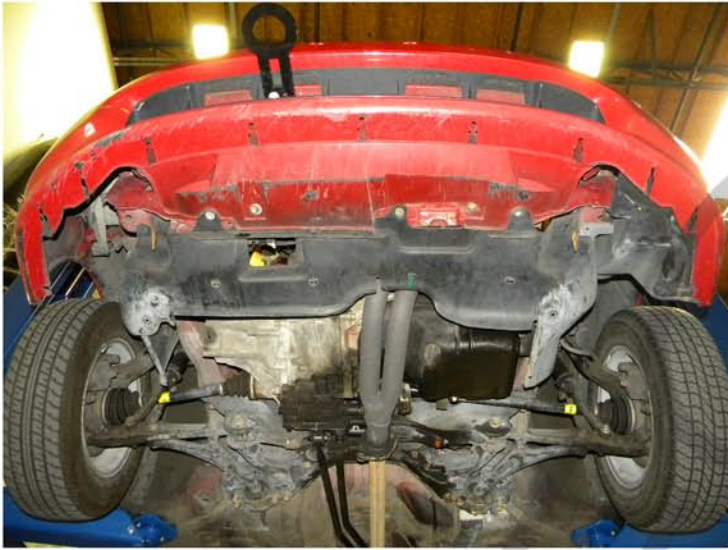
1. Remove all the 10mm bolts from beneath the bumper

If you experience any difficulties that the instruction did not cover, Please seek local auto shop for advise. Please wear protection before you work on your vehicle. An assistant is helpful when removing the front bumper. Please be careful while working with the bumper or body part to avoid scratching. Do not make direct contact with the halogen bulb or the wire assembly until the unit has cooled down after use.