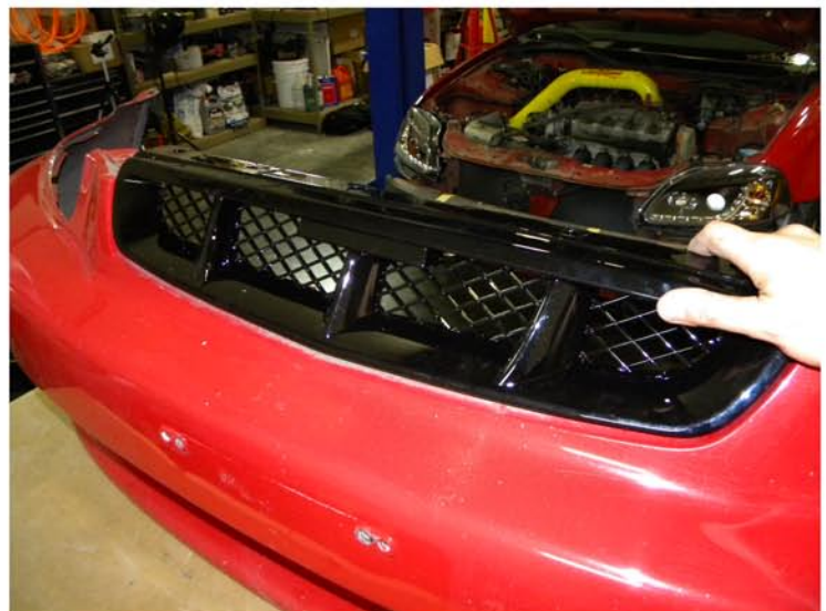
10. Place the Mugen style gront grille back on