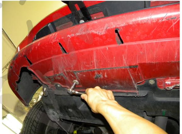
14. Tighten two 10mm bolts