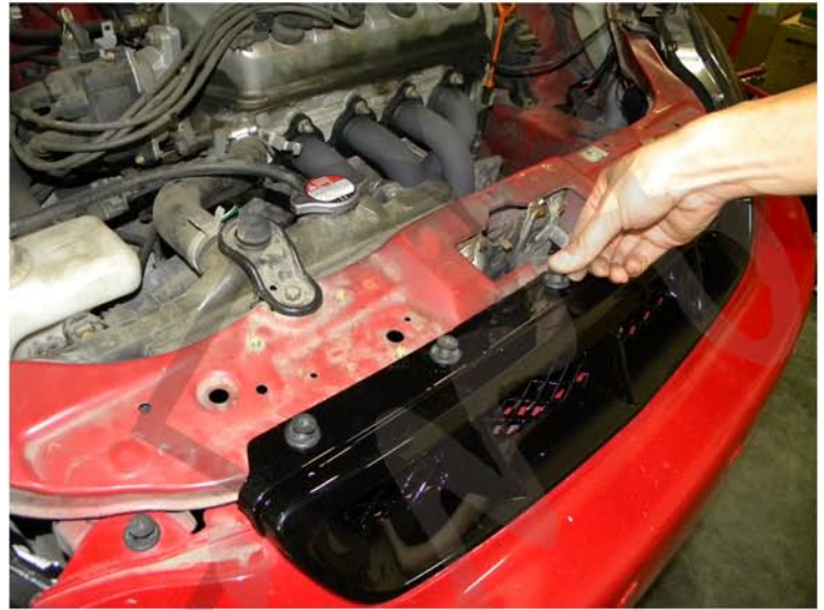
12. Replace the seven plastic clips