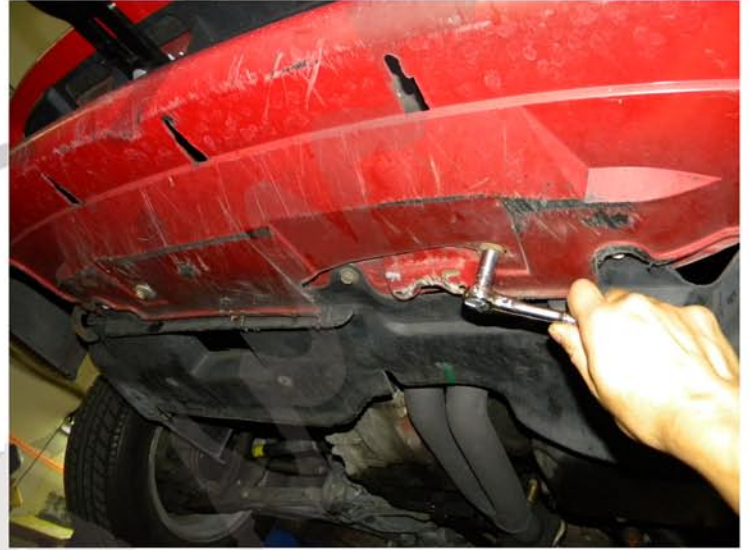
2. Demonstration in the picture above