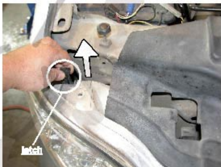
2. Pull out one latch frist (BOTH SIDE)