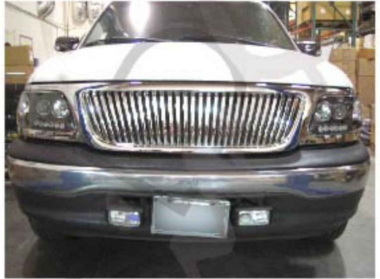
11. Install the bolt from corner light (BOTH SIDE)