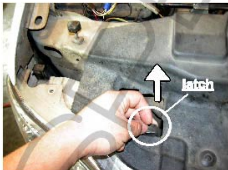
3. Then pull out the other latch. Afet that, pull out the corner light and headlight (BOTH SIDE)