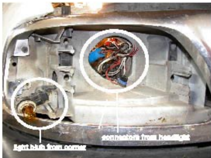
4. Remove the light bulb from corner, then disconnect connectors from headlights (BOTH SIDE)