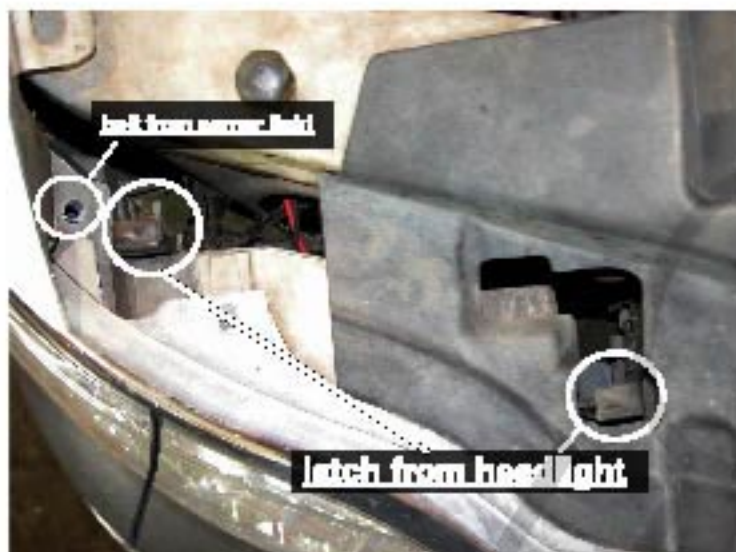
1. Remove the bolt from corner light (BOTH SIDE)