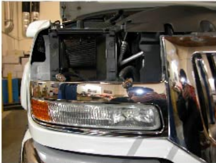
7. After remove the headlight, you will see like this. Before Install the headlight, please connect the connectors