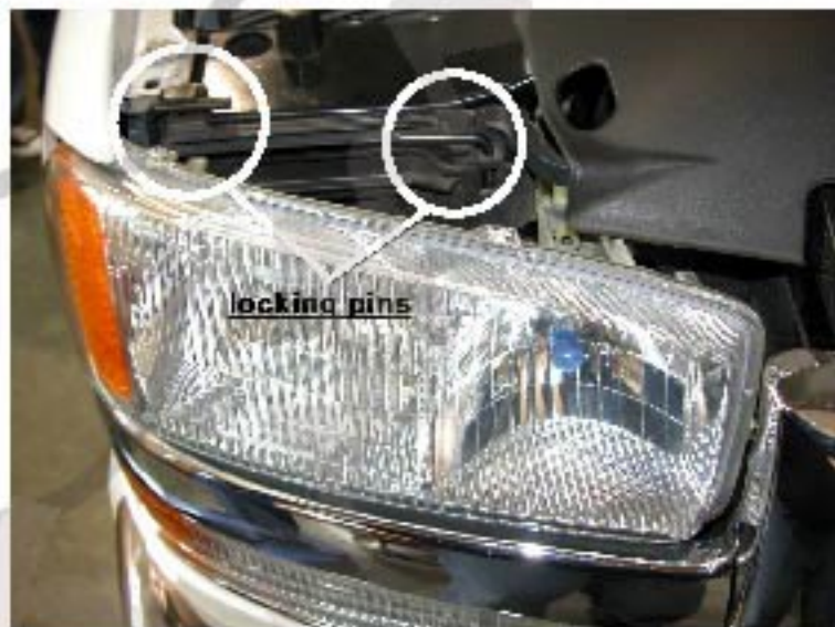
2. There are two locking pins