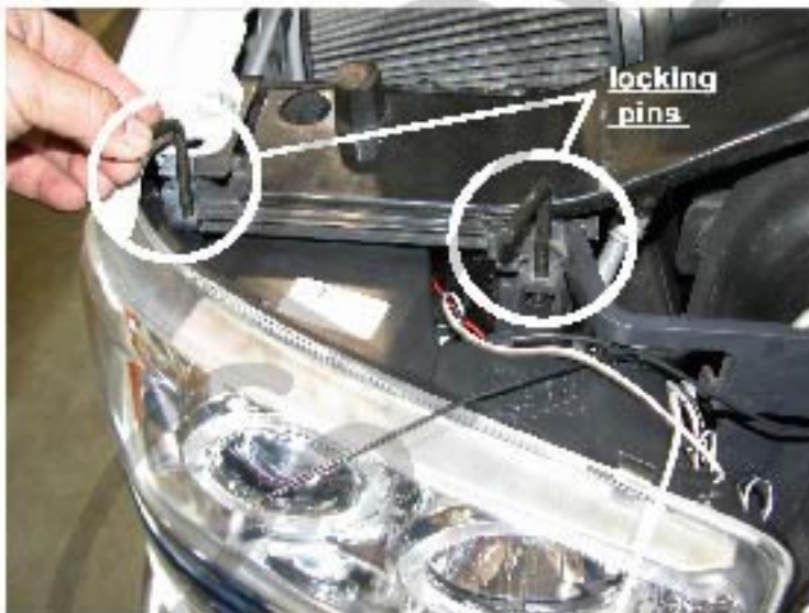
9. Install the two locking pins (Please repeat the picture order from 1 to 10 on opposite side)