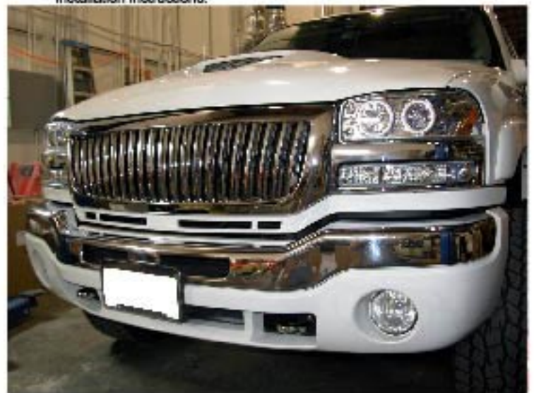
10. The installation now is complete