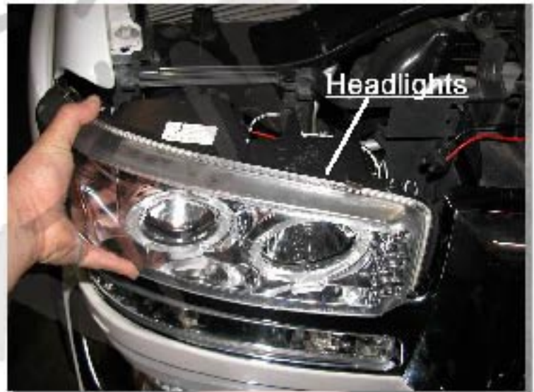
8. Install the headlight gently please see the "Halo and L.E.D.Installation Instructions" if your headlights don't have HALO or L.E.D. You can skip the the Installation Instructions.