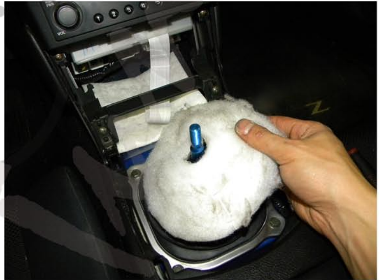
20. Put back the fabric padding