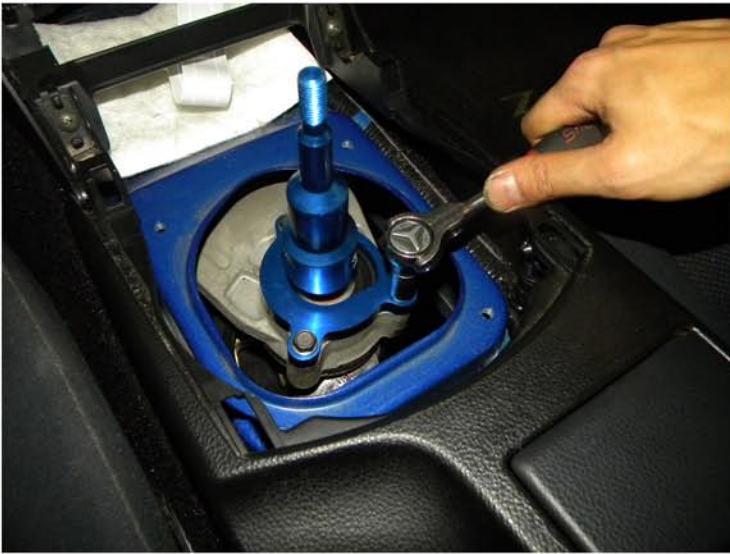
17. Screw back on the three 10mm bolts