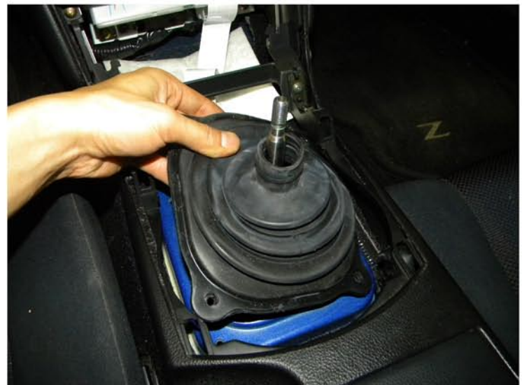
10. Take-off the rubber shift boot