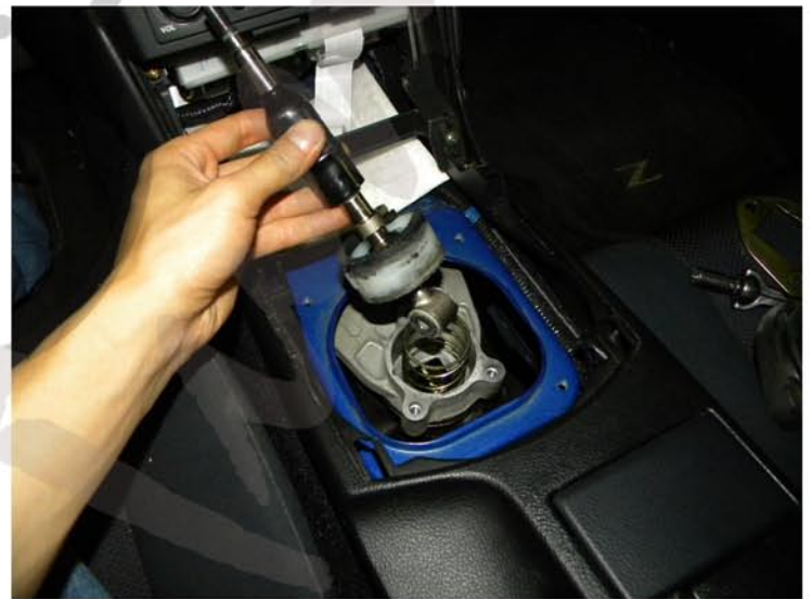
14. Pull up and out the original shifter