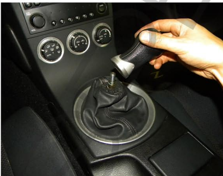
3. From inside the car and unscrew the shift knob off the shifter