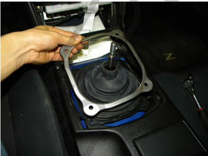
9. Remove the bracket