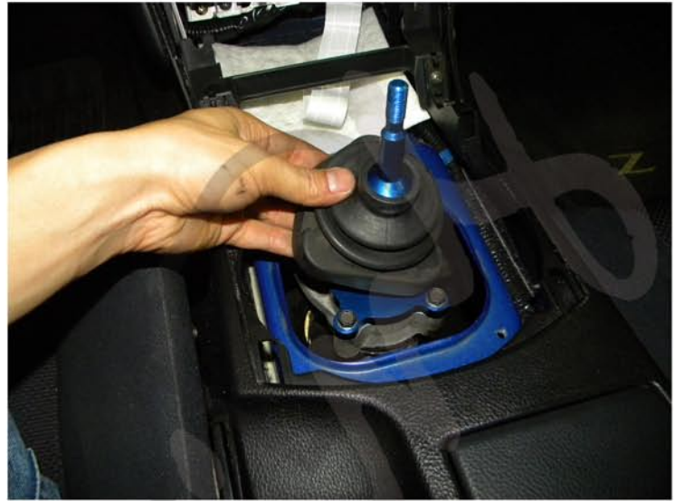
18. Place back the smaller inner rubber boot