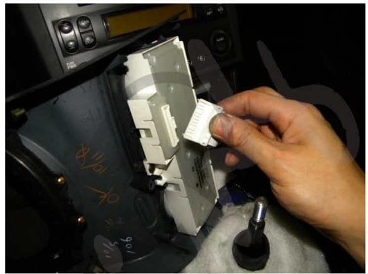
6. Unplug the harness from the temperature control council