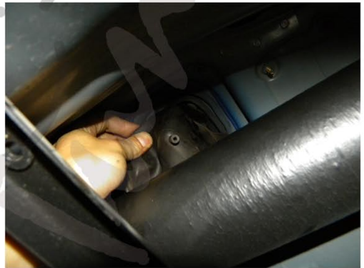
26. Place back the rubber boot