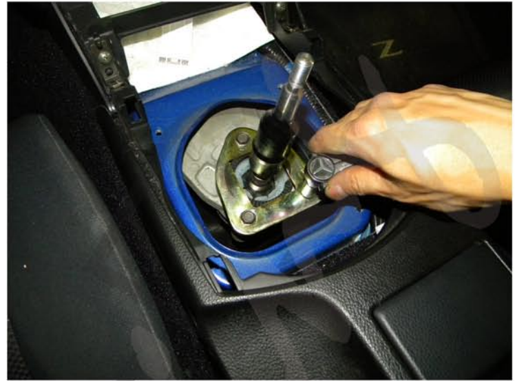
12. Unscrew three 10mm bolts