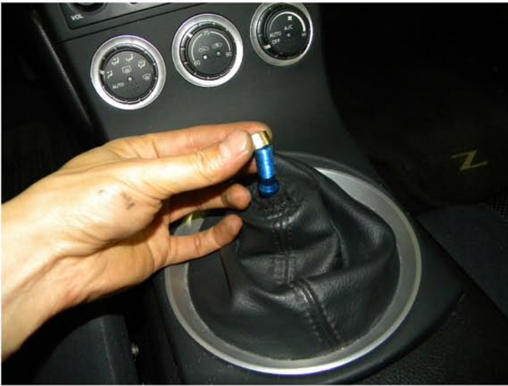
23. Put back the washer ring