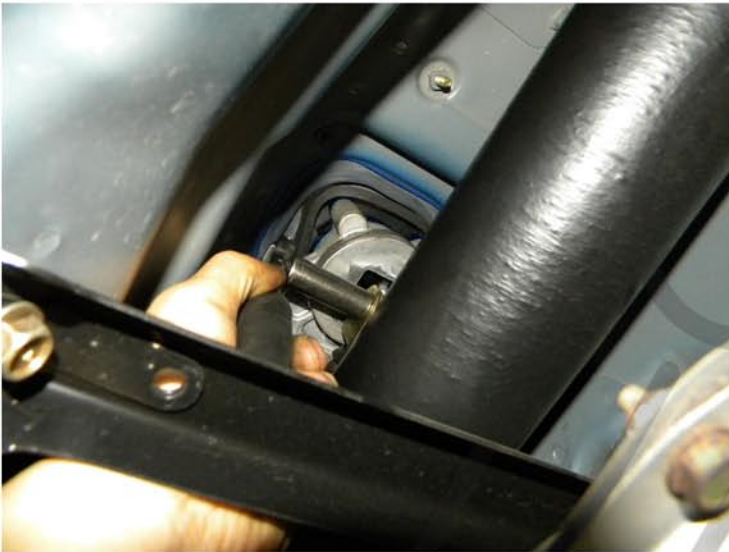
25. Replace the 12mm bolt connecting the shifter to the shift link