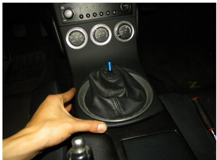
22. Place back the council to its original location