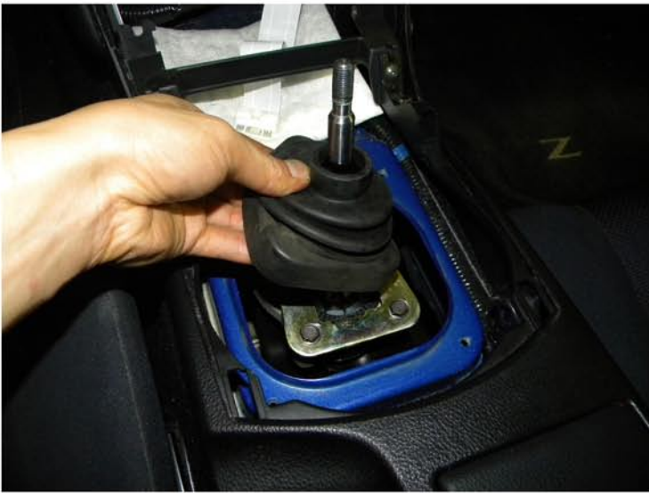
11. Take-off the smaller inner rubber shift boot