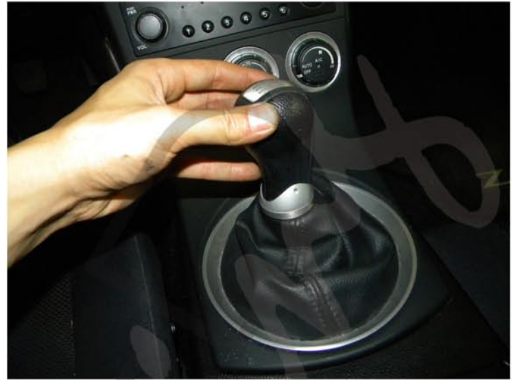
24. Screw back on the shift knob