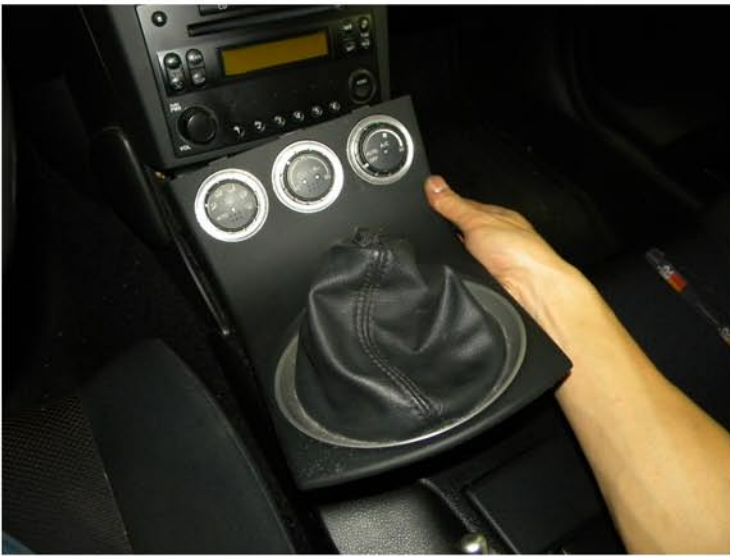
5. remove the temperature control council from locking clips