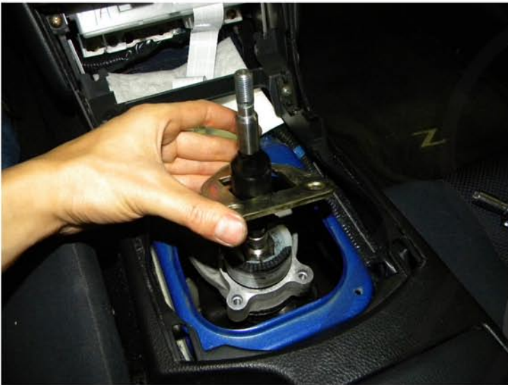
13. Take-off the triangle bracket