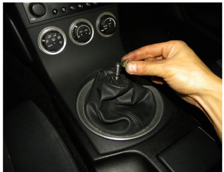
4. Take off the washer ring