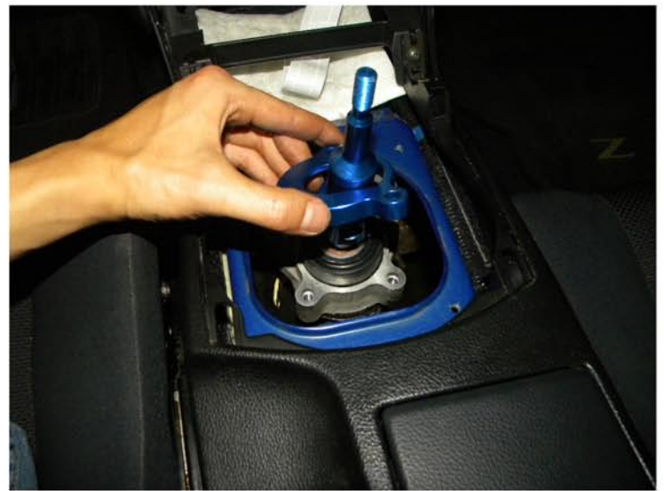
16. Place the bracket over the short shifter