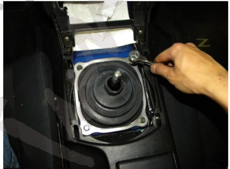
8. Unscrew four 10mm bolts from the bracket