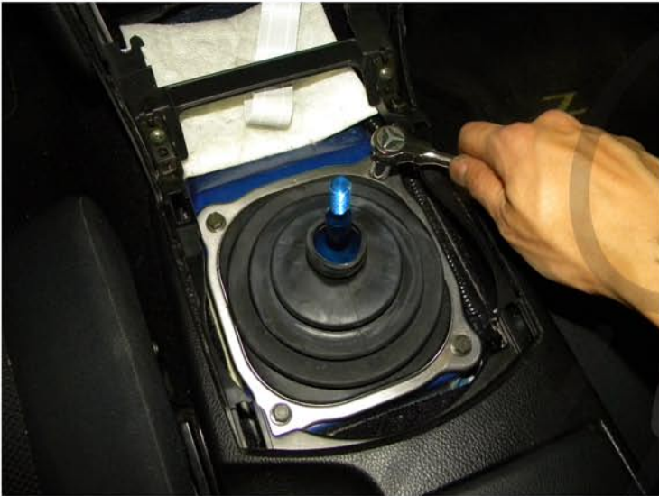
19. Place back the outer rubber boot