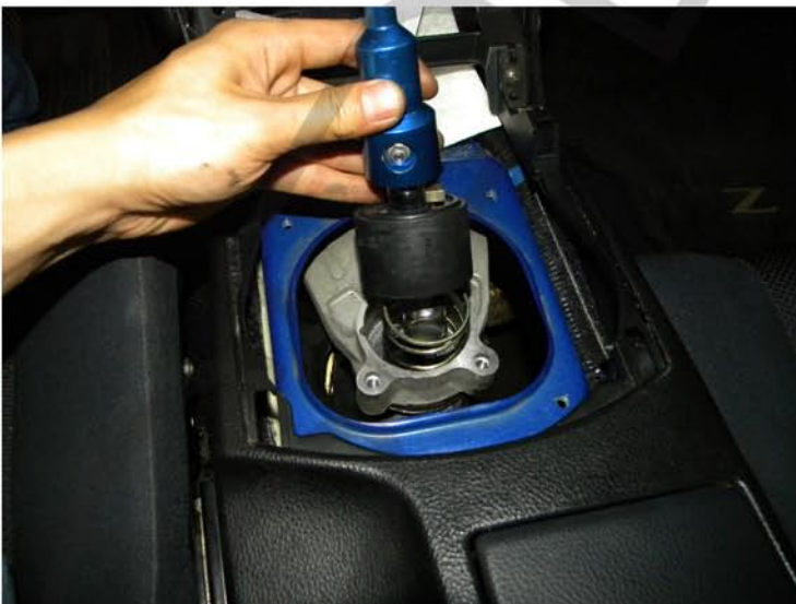
15. Replace with the short shifter