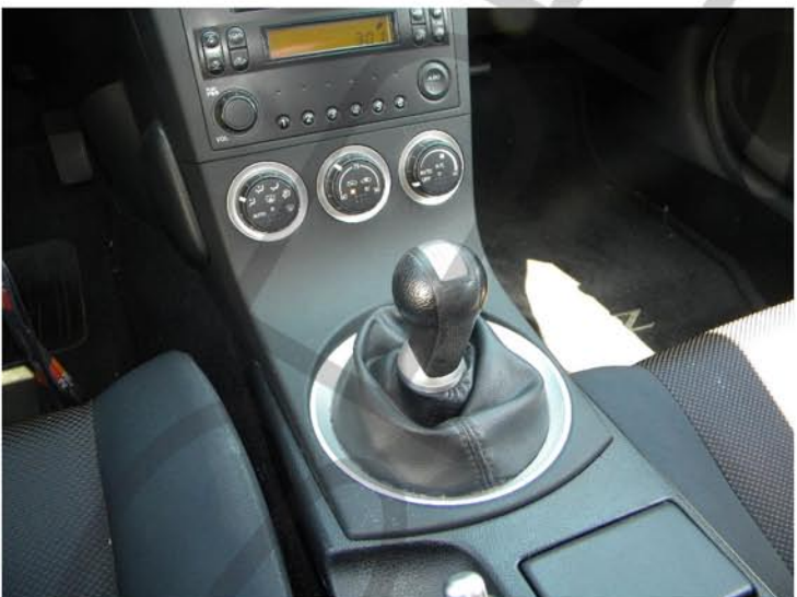
27. The installation now is complete.