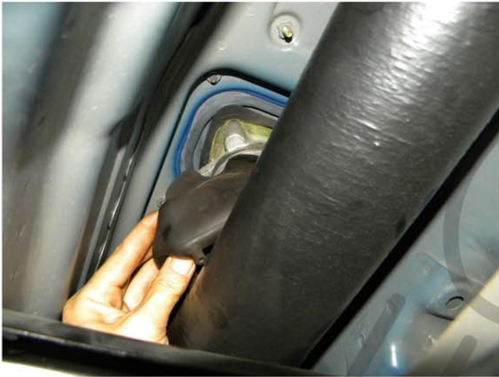
1. Start beneath the car where the shifter is located; remove the rubber boot cover

If you experience any difficulties that the instruction did not cover, Please seek local auto shop for advise. Please wear protection before you work on your vehicle. An assistant is helpful when removing the front bumper. Please be careful while working with the bumper or body part to avoid scratching. Do not make direct contact with the halogen bulb or the wire assembly until the unit has cooled down after use.