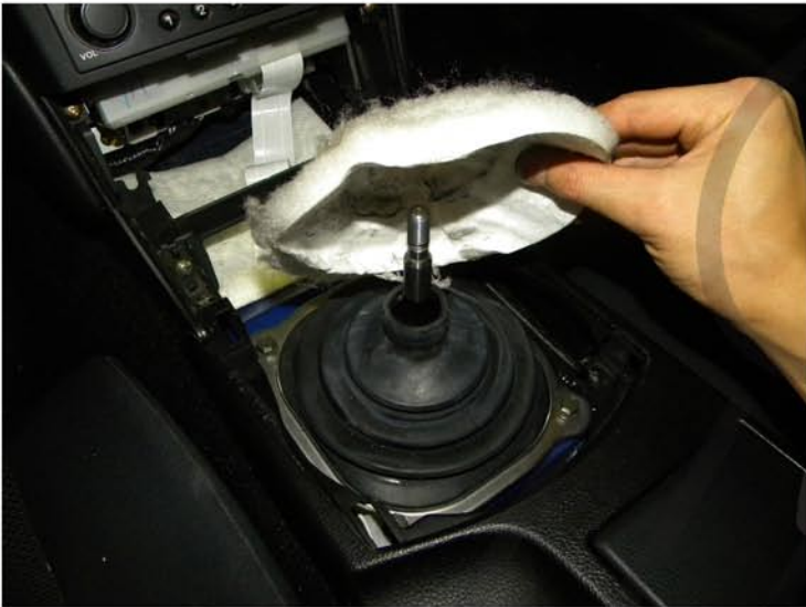
7. Remove the fabric padding from the top of the shifter