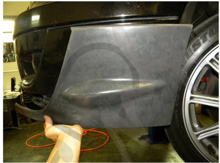
6. Place the bumper cover into position