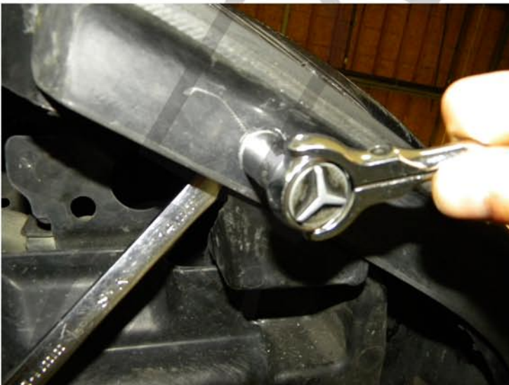
9. Tighten the 14mm nut and the 12mm bolt locate on the bottom end