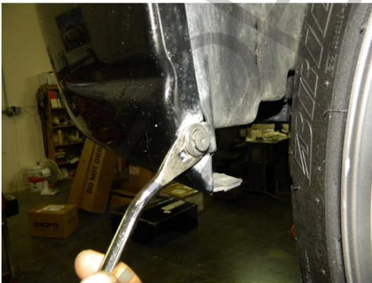
3. Remove the plastic clip