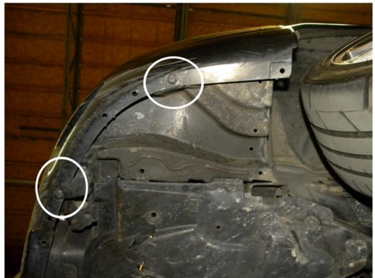
4. (2) Plastic clips location