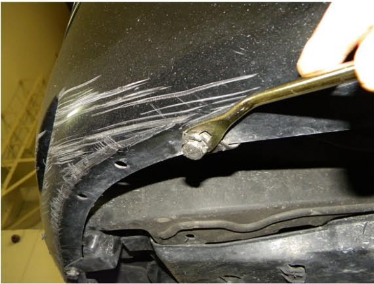
5. Remove the (2) plastic clips