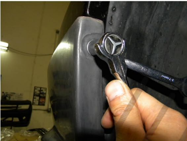
7. Tighten the 14mm nut and the 12mm bolt