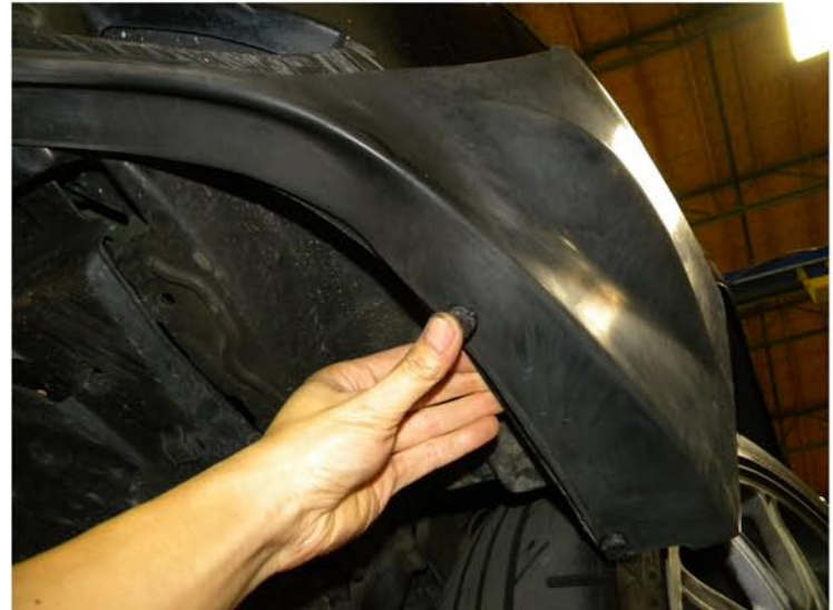
10. Install the (2) plastic clips