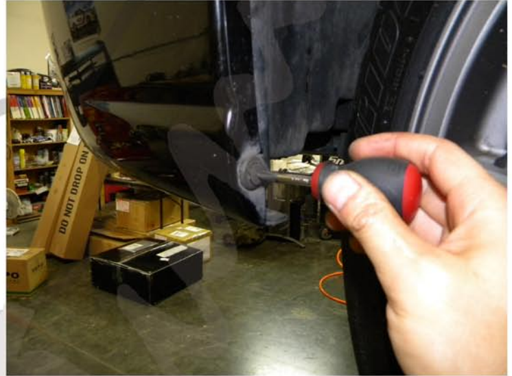
2. Remove the plastic clip