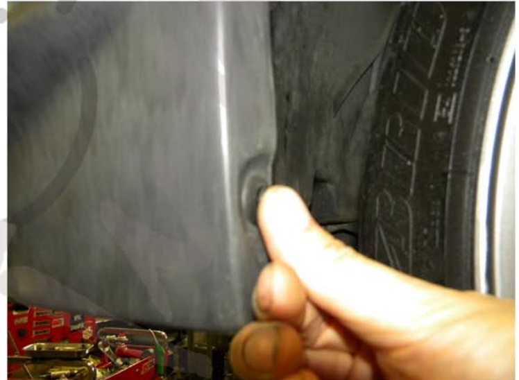
8. Install the plastic clip