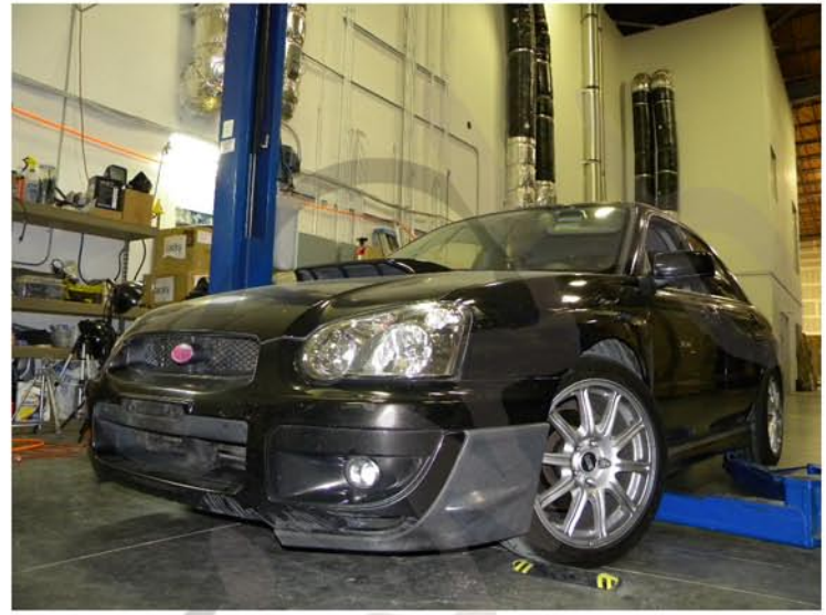
12. The installation is now complete