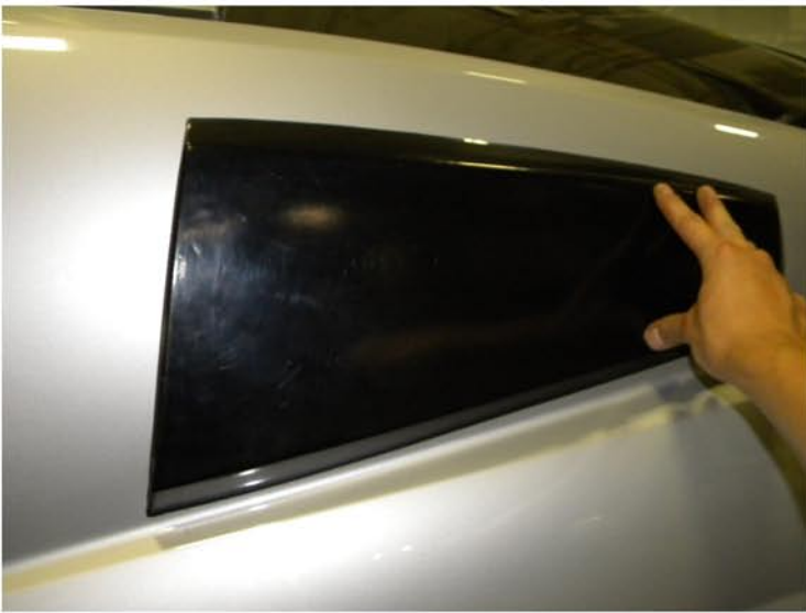
5. Apply and press the louver onto the window