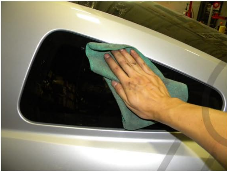
1. Wipe the surface clean

If you experience any difficulties that the instruction did not cover, Please seek local auto shop for advise. Please wear protection before you work on your vehicle. An assistant is helpful when removing the front bumper. Please be careful while working with the bumper or body part to avoid scratching. Do not make direct contact with the halogen bulb or the wire assembly until the unit has cooled down after use.