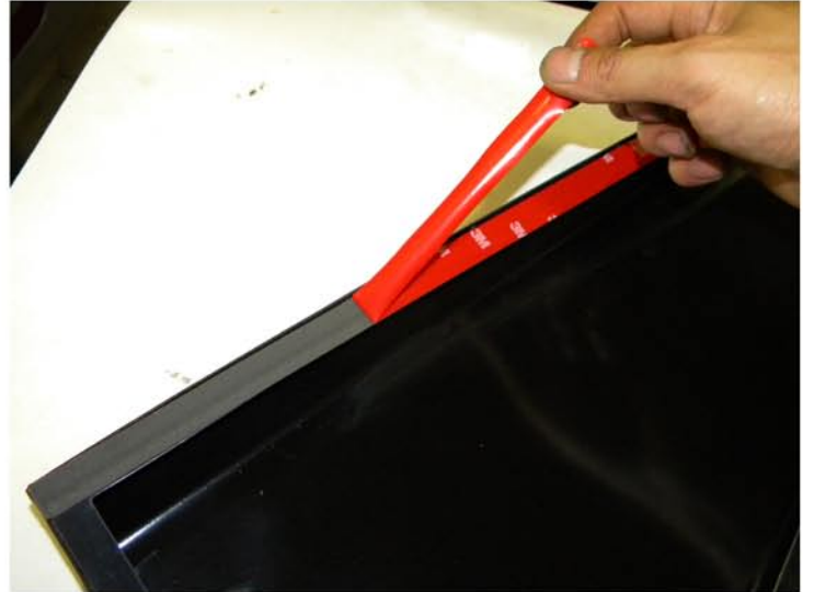
4. Peel off the backing