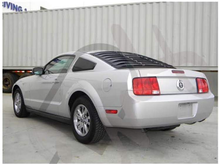
6. Please repeat the steps from 1 to 5 for the opposite side