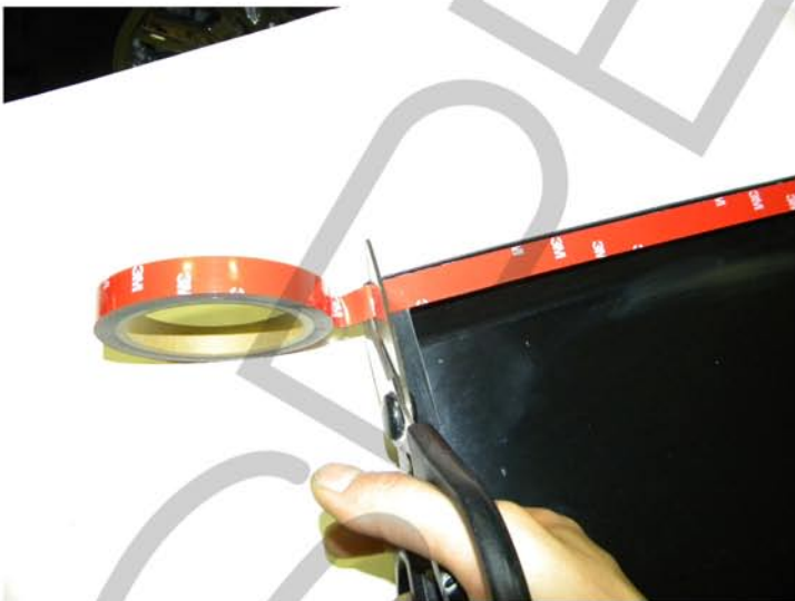
3. Cut the double sided foam tape to length