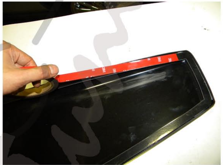
2. Apply the double sided foam tape to the edges of the louver