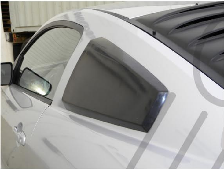
7. The installation is now complete