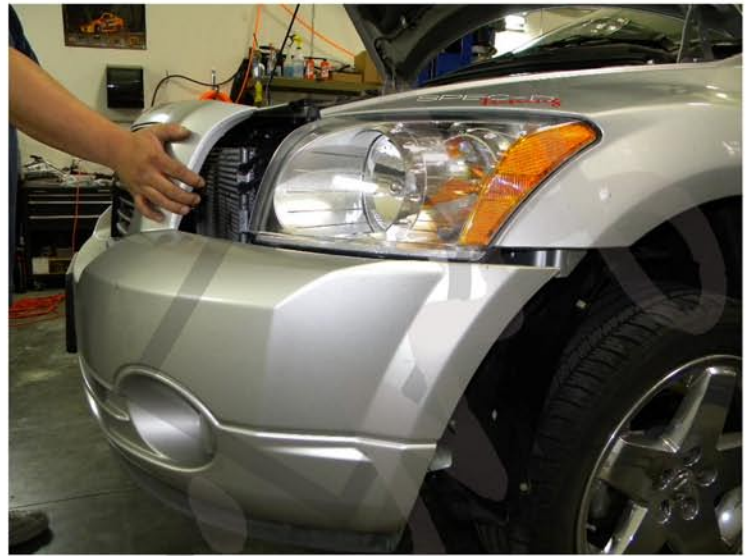
6. Remove the front bumper