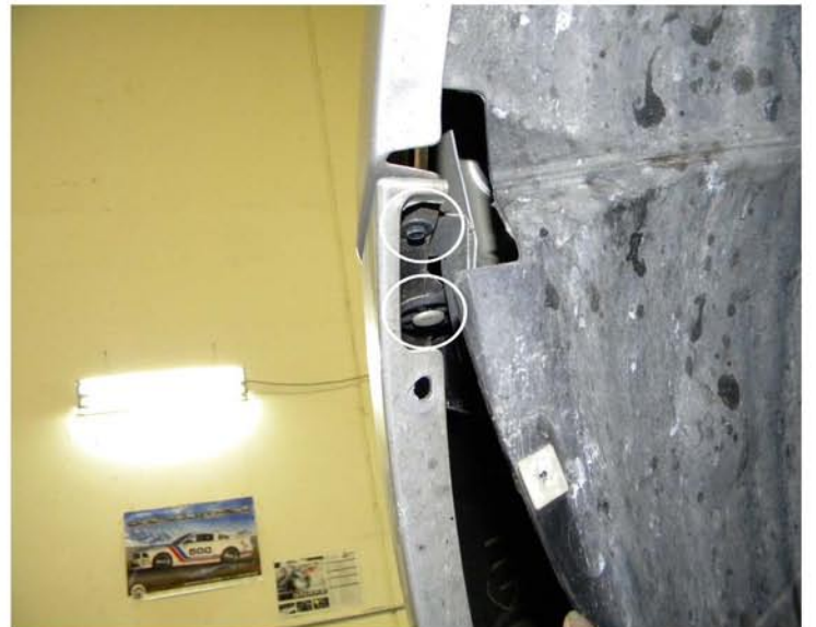
4. Remove one 7mm bolt and one clip from inside of the bumper