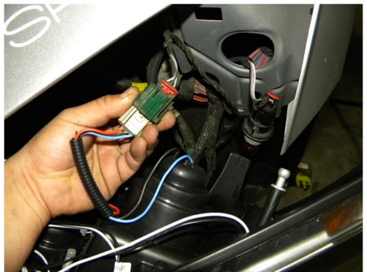
10. Connect all the headlight harnesses

Please see the Halo and L.E.D installation instruction If your headlights don't have HALO or L.E.D. You can skip it