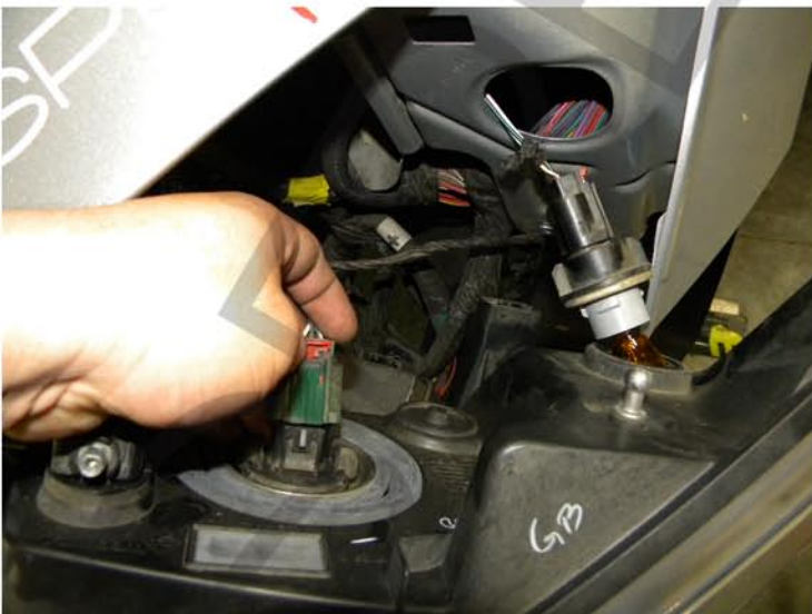
9. Disconnect all headlight harnesses then remove the headlight