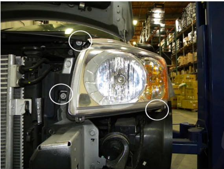
7. Remove three 10mm headlight bolts