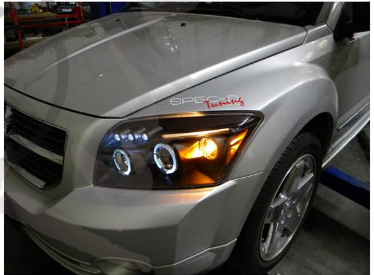
20. The installation is now complete