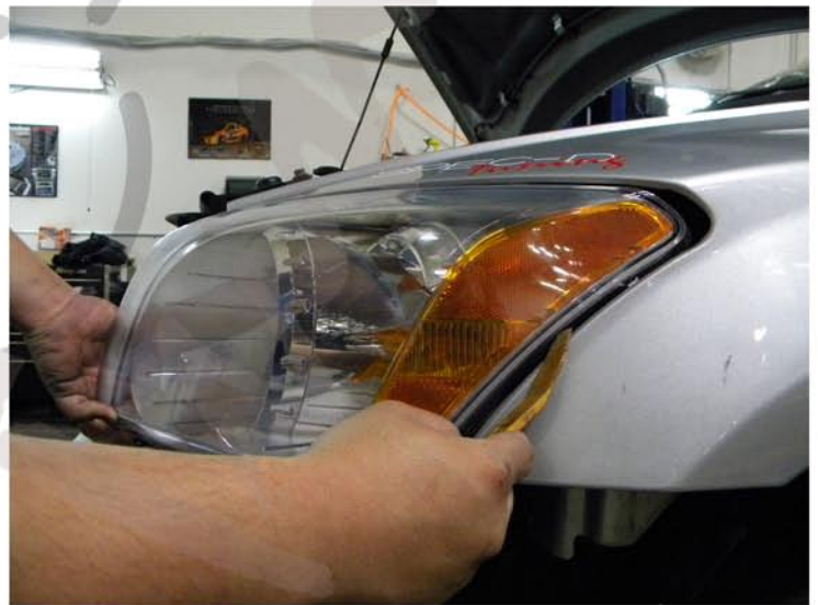
8. Pull out the headlight