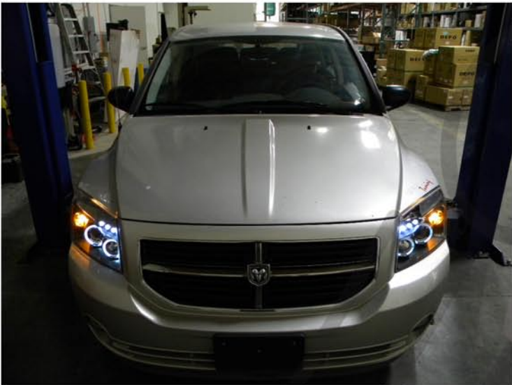
19. Please repeat the steps from 1 to 19 for the opposite side