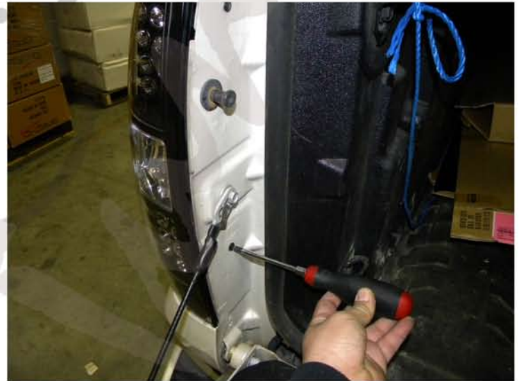
8. Tighten the (2) phillips head screws