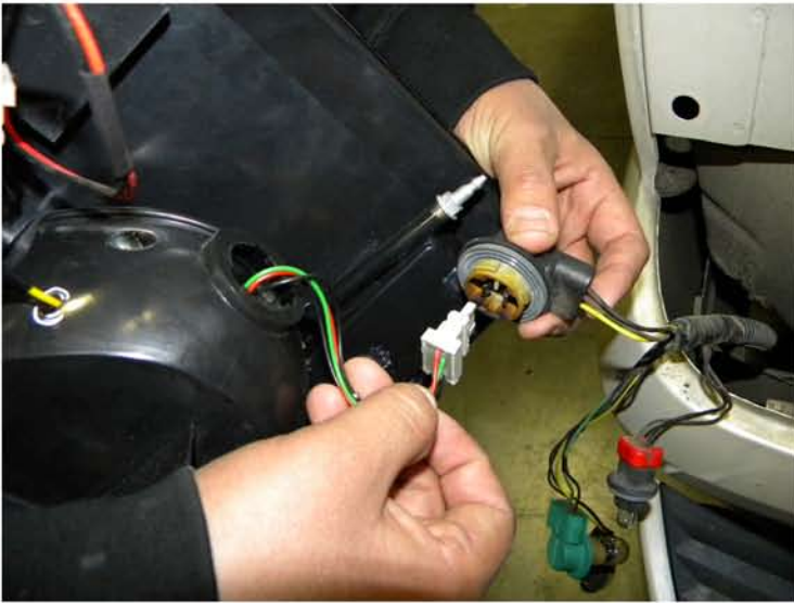
5. Plug in the LED tail light into the brake light socket please see the " L.E.D. tail lights installation instructions" If your tail lights don't have L.E.D. you can skip the installation instructions.