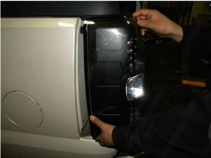
7. Place the LED tail light into stock location