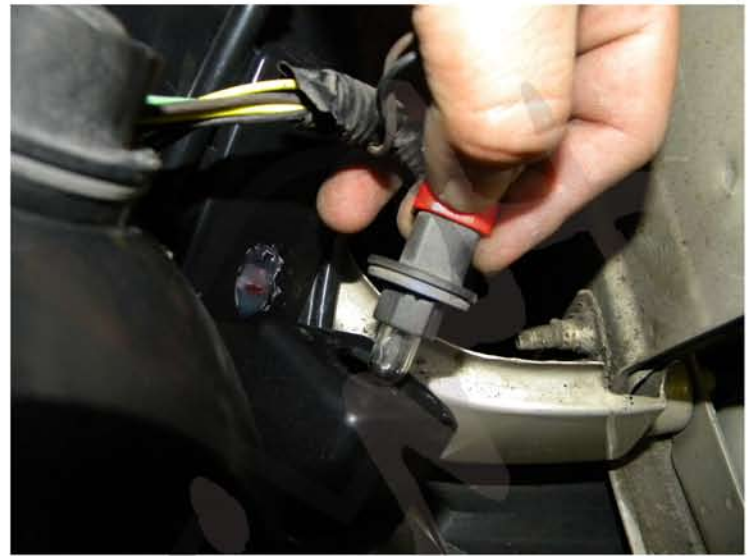
6. Plug in the tail light sockets into the LED tail light