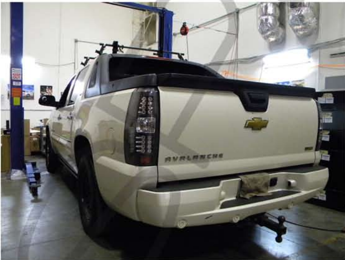
9. Please repeat the steps in order from 1 to 8 for the opposite side The installation is now complete