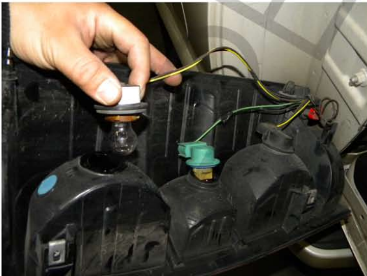
3. Remove the tail light sockets from the tail light