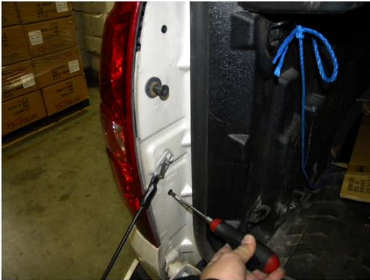
1. Remove the (2) phillips head screws

Do not make direct contact with the halogen bulbs or the wire assembly until the unit has cooled down after use.