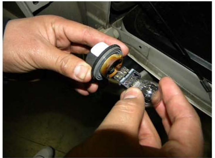
4. Remove the brake lightbulbs