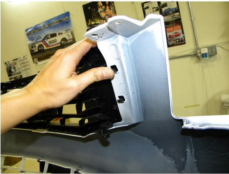
11. Undo plastic clips securing grill onto front bumper