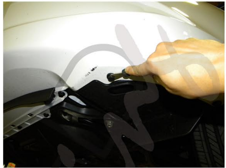
6. Remove 10 plastic clips beneath the front bumper