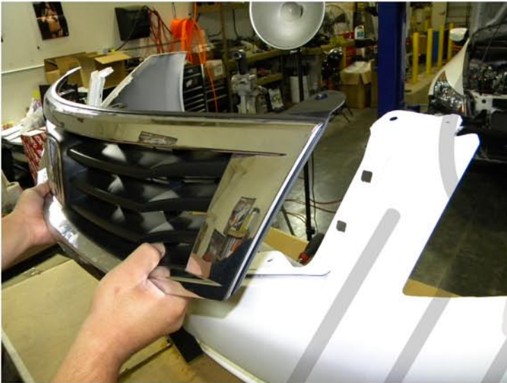
13. Remove factory front grill