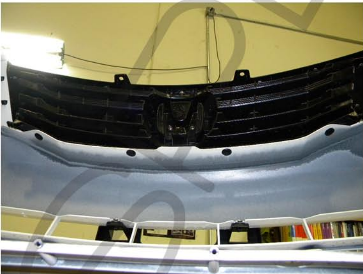
9. Location of (4) plastic clips