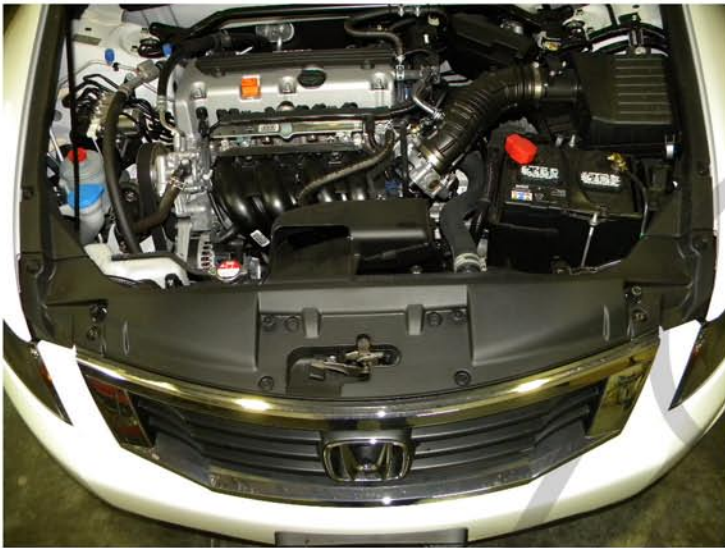
1. Location of (8) plastic clips

If you experience any difficulties that the instruction did not cover, Please seek local auto shop for advise. Please wear protection before you work on your vehicle. An assistant is helpful when removing the front bumper. Please be careful while working with the bumper or body part to avoid scratching. Do not make direct contact with the halogen bulb or the wire assembly until the unit has cooled down after use.