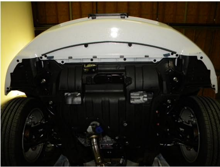
5. (10) plastic clips location