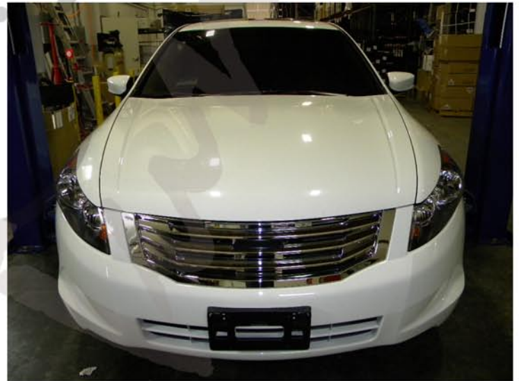
20. The installation is now complete