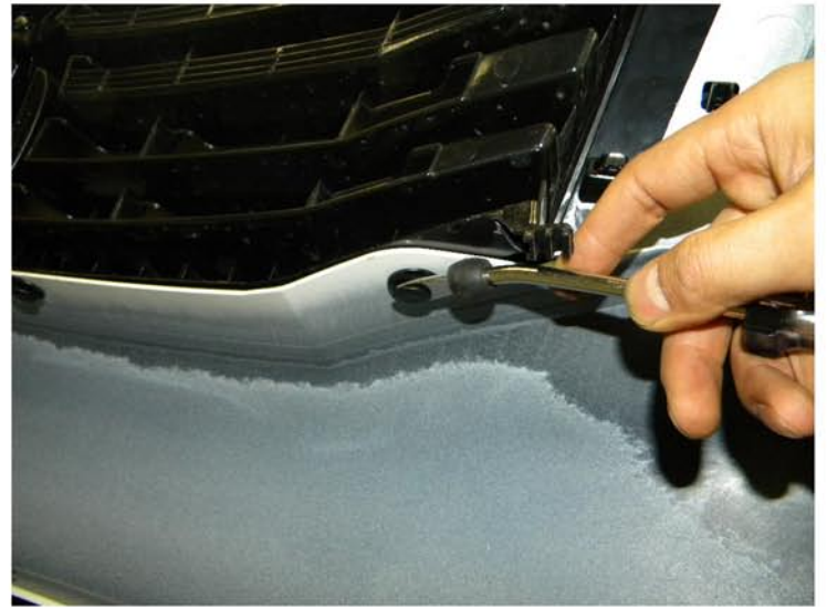
10. Remove (4) plastic clips