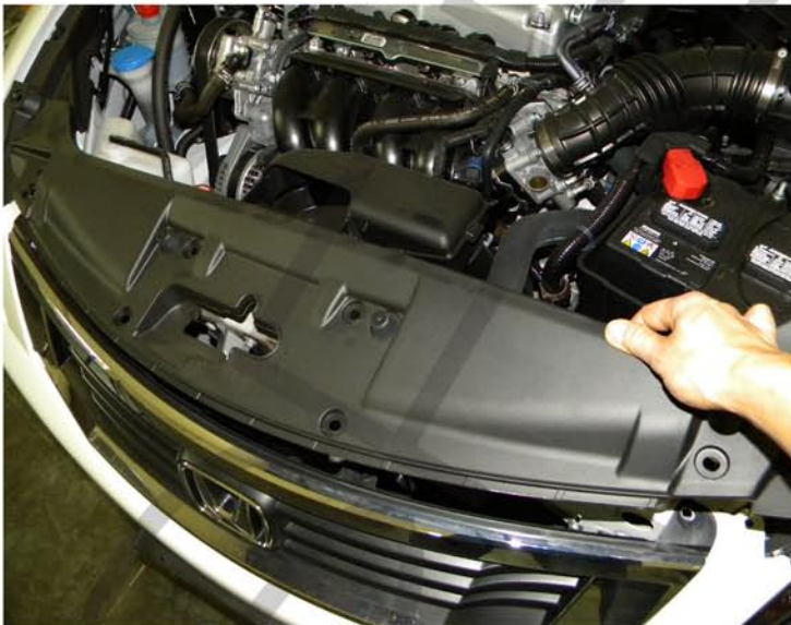
3. Remove plastic moulding