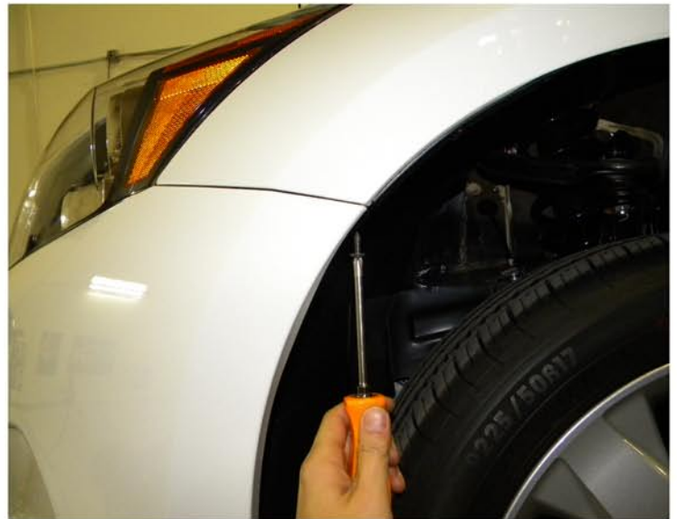
4. Remove phillips head screw