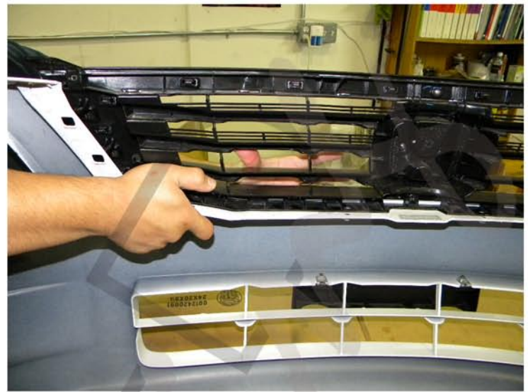
12. Press grill forward