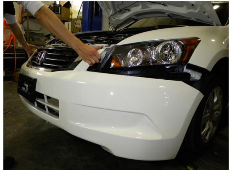
16. Replace front bumper