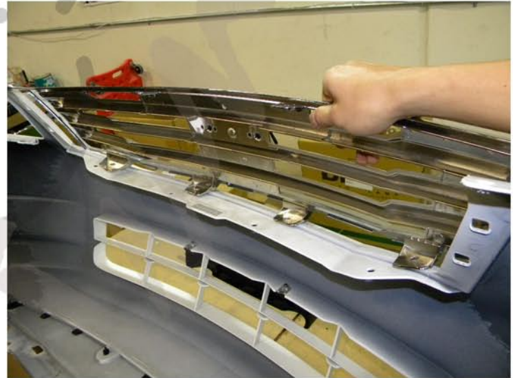
14. Place aftermarket grill in stock location