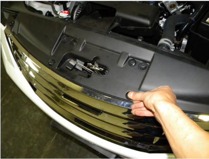
17. Replace plastic moulding and secure with (8) plastic clips