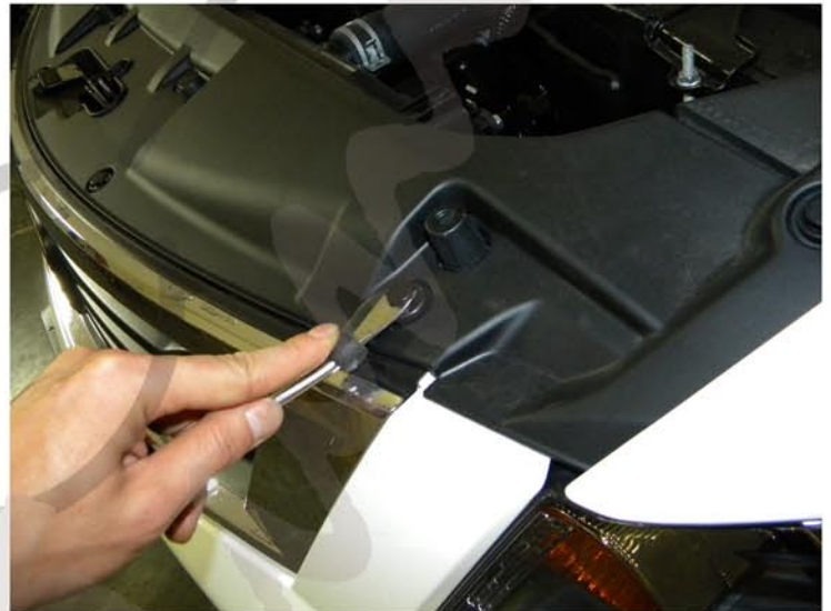
2. Remove (8) plastic clips