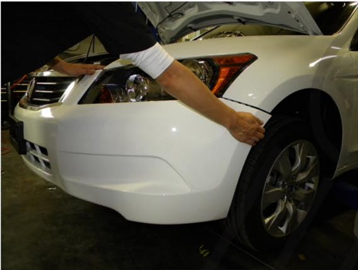
7. Tug on sides of front bumper