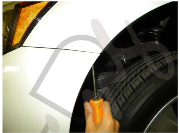
18. Replace phillips head screw