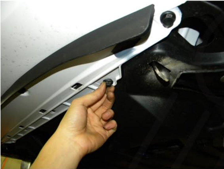
19. Replace 10 plastic clips on bottom of bumper