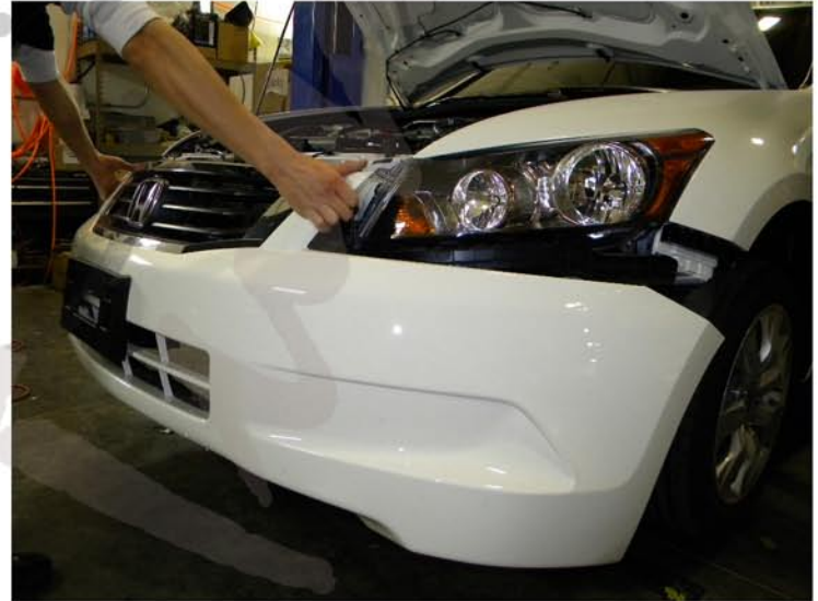
8. Remove front bumper