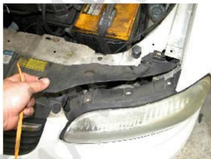
2. Remove the plastic from top of the headlight shielding