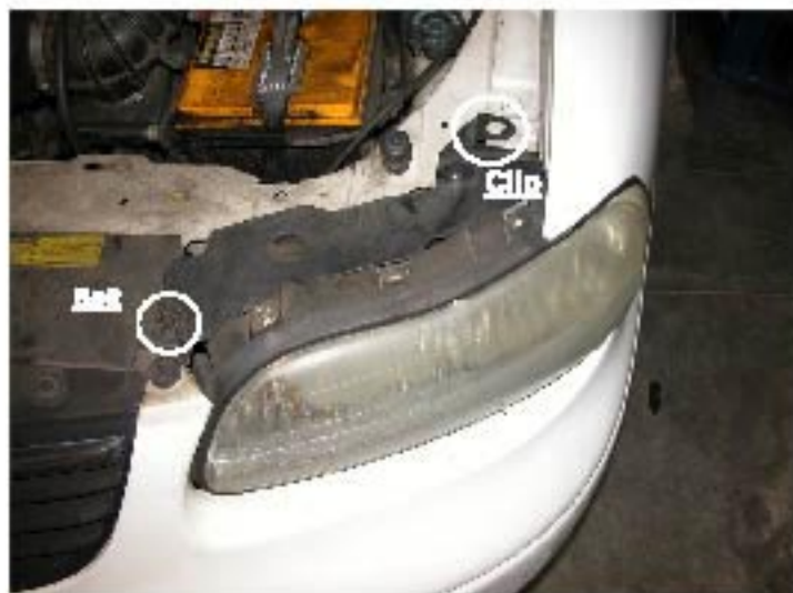
1. Remove the bolt and pull out the clip from the top of the headlight

*Do not make direct contact with the halogen bulb or the wire assembly until the unit has cooled down after use.