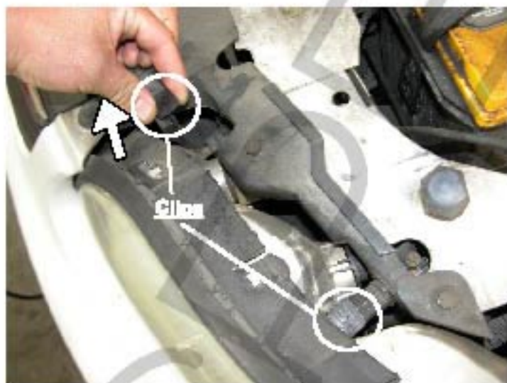
3. There are two clips that need to be pulled out