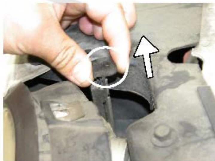
4. Pull out the outer clip