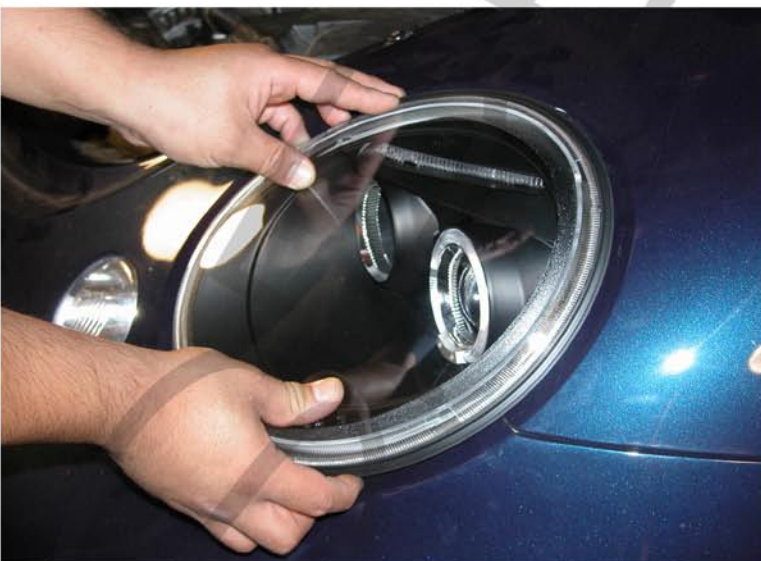
9. Install the headlights