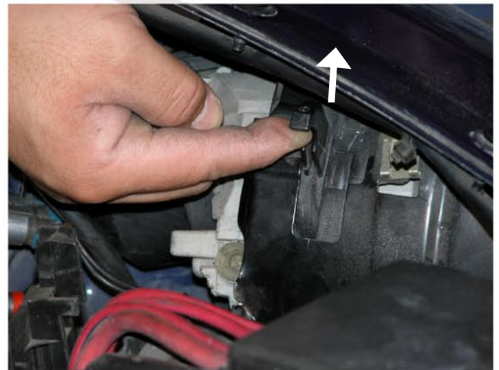
4. Pull the latch to unlock the headlight