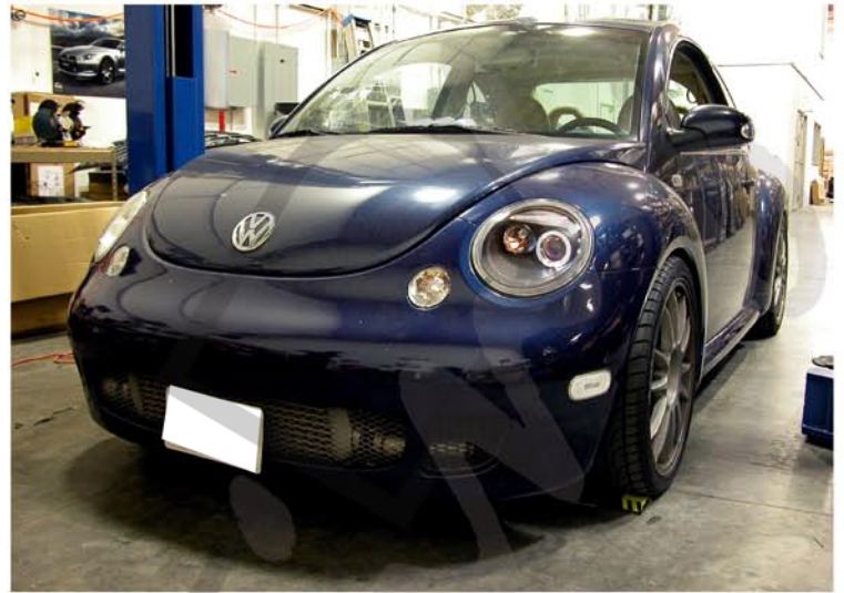
12. The installation now is complete