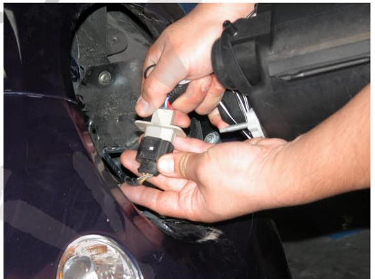
8. Bring the projector headlights to the vehicle and connect the headlight connector