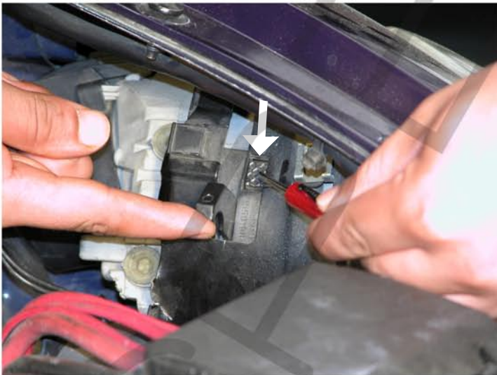
3. Use a flat tip screwdriver to push down the button