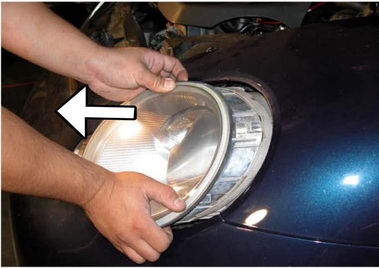
5. Pull out the headlight slightly, just enough to see the back of the headlight