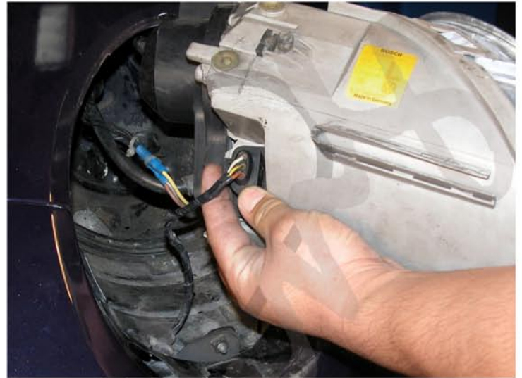
6. Remove the connectors from the headlight