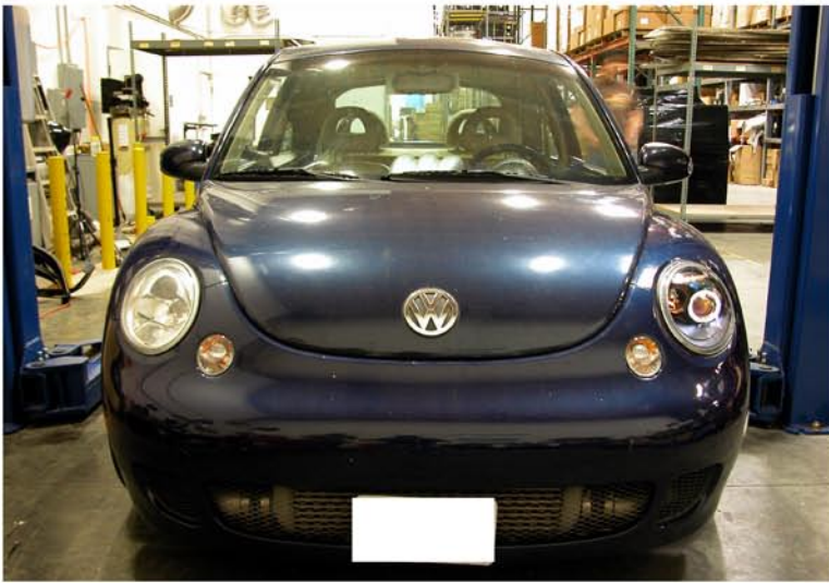
11. Please repeat the picture order from 1 to 11 for the opposite side