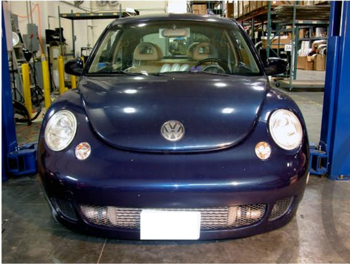
1. Open the hood