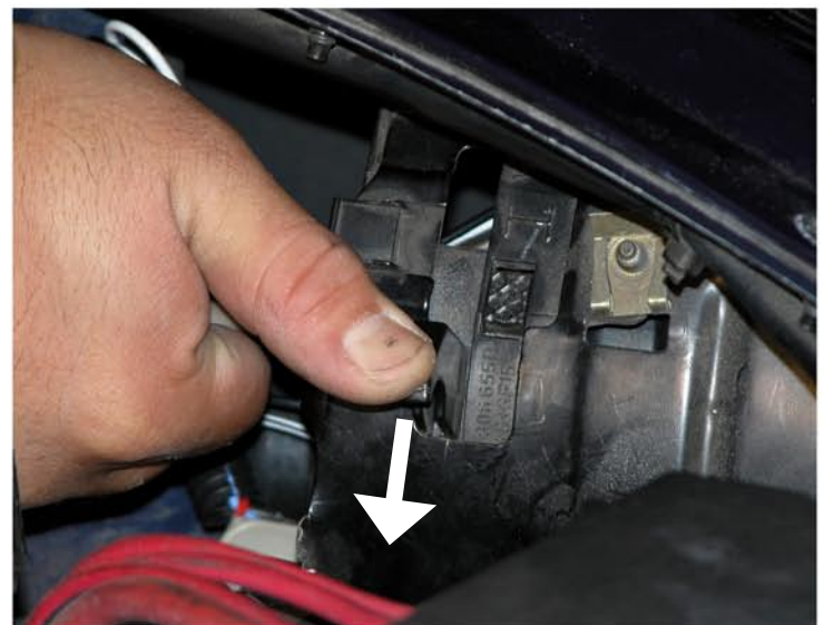
10. Push the latch back to the original spot to lock the headlight