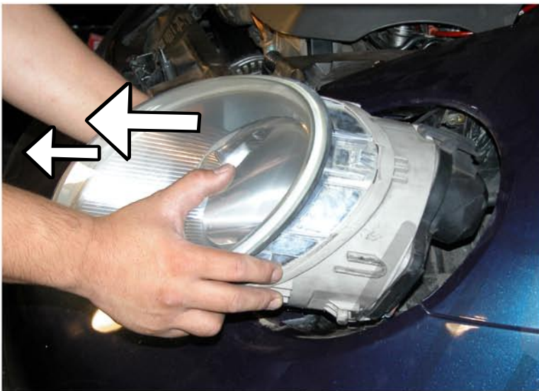
7. Remove the headlight